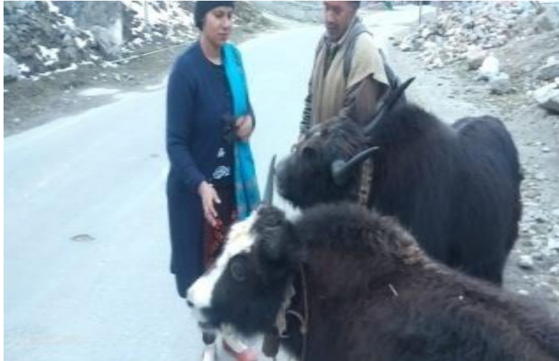
Image 5. The Yak treated by the Bhotias as the holy animal. Picture Credit- Shikher Sharma (Showing the author thankfully acknowledging the support by the Bhotia community during the interview).

of the shrine (Jha, 1996). They also worship Yak and treat it as the holy Animal (Image 5).