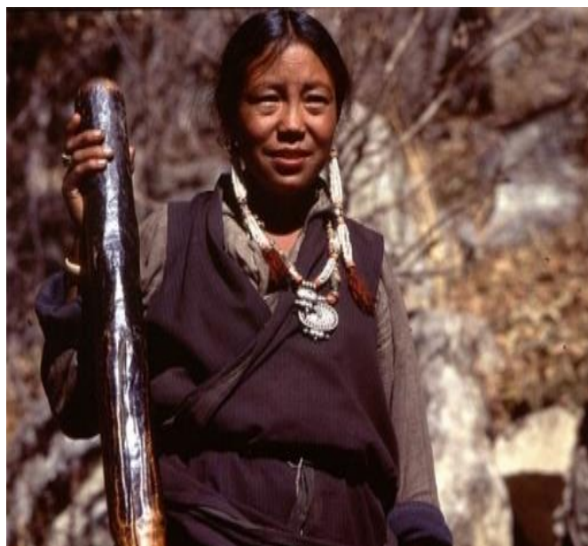
Image 1. A typical Bhotia woman.