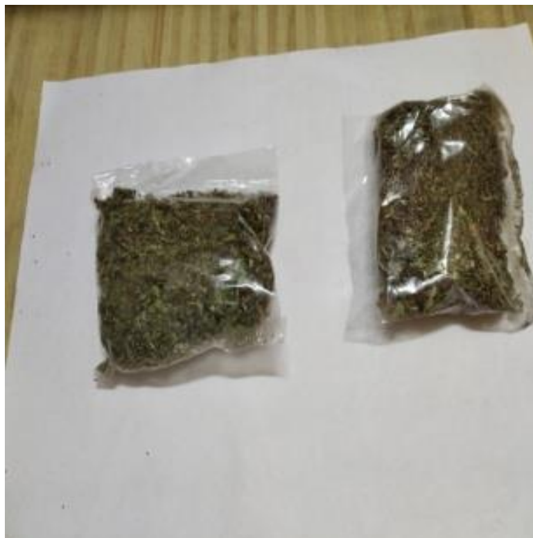
Image 3. Bhotia fragrance based herbs for tea.