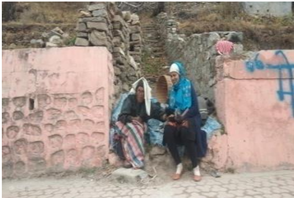
Image 4. The researcher personally observing the selling of the Bhotia local products.