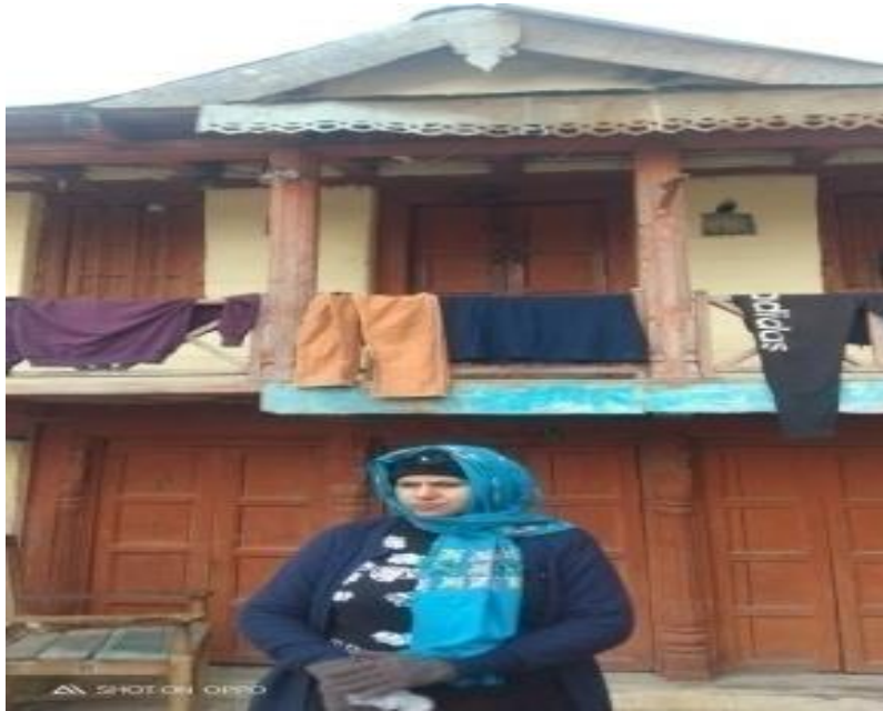
Image 2. Traditional Bhotia home.