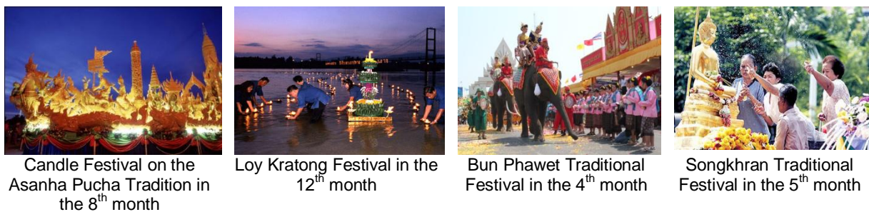
Figure 6. All famous festivals mentioned in Isan region and throughout of Thailand festivals.

principal Buddha image. When it was housed in the temple, it has given virtues to people so people in Phana District have held a festival for thanking it since 1721 and up to now the festival is still held annually. It is a three day festival included both Buddhist activities and many kinds of entertainment. The first day of festival begins on the fifteenth waxing moon of the third lunar month or the early of February every year.