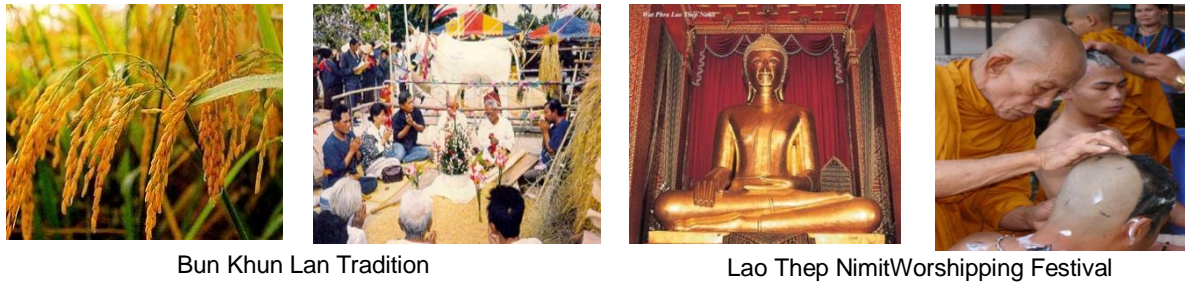
Figure 5. An atmosphere of Bun Khun Lan Tradition and Phra Lao Thep Nimit Worshipping Festival, Amnat Charoen Province.