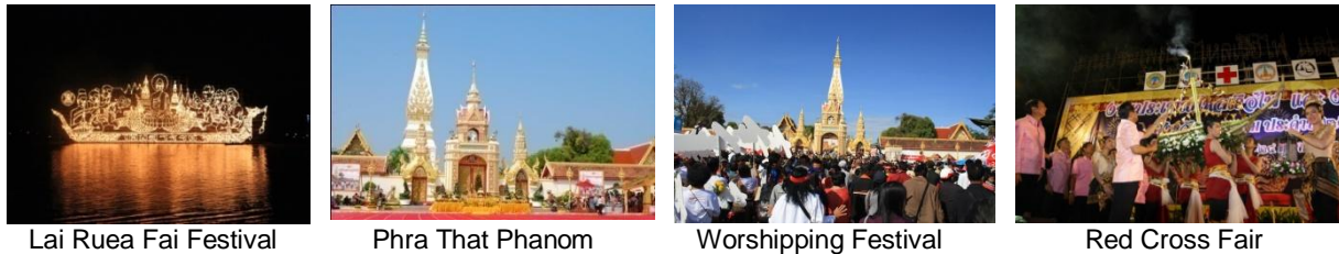
Figure 2. An atmosphere of Lai Ruea Fai Festival and The Red Cross Fair and Phra That Phanom Worshipping Festival, Nakhon Phanom Province.