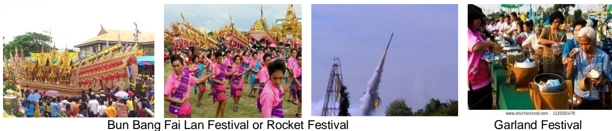
Figure 4. An atmosphere of Bun Bang Fai Lan Festival or Rocket Festival and Garland Festival at Ban Yard Fah, Yasothon Province.

competitions are held every year. Considering it is the meeting point for people across the two countries, Tourists will visit Mukdahan during early January or May seems to be most apt for business purposes. There are two major categories, speed racing for small, medium, and large boats that all participating boats are dug to have a round hull and will compete on a 3 kilometre-long distance on the Mekong River. Another category is the fantasy boat contest in which the racing boats are decorated, particularly at the figureheads. Thus, there are two major categories of prizes classified into the first, the second, and the third in each category (Figure 3).