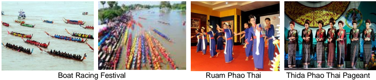
Figure 3. An atmosphere of Boat Racing Festival and Ruam Phao Thai Mukdahan or Thida Phao Thai Pageant in Mukdahan Red Cross Fair, Mukdahan Province.