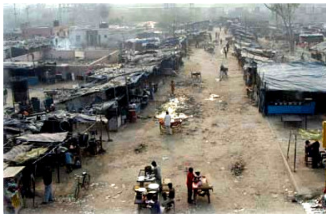
Figure 2. Environmental condition in study area.

worsens the intensity of health disorders and co-morbidities (Harikrishnan, 2009).