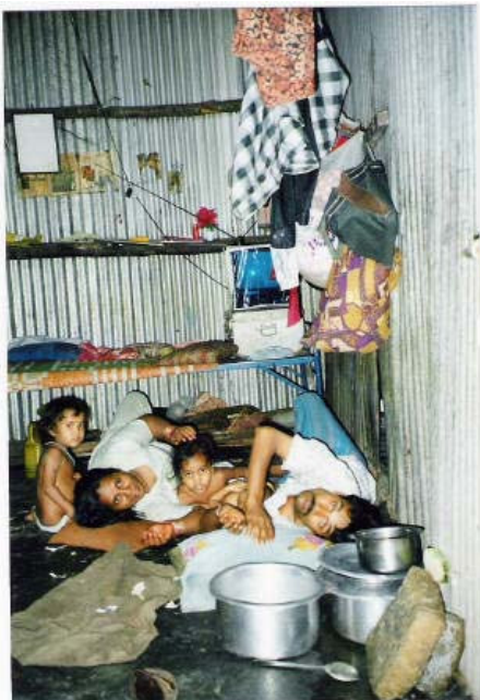
Figure 3. Housing condition in the study area.