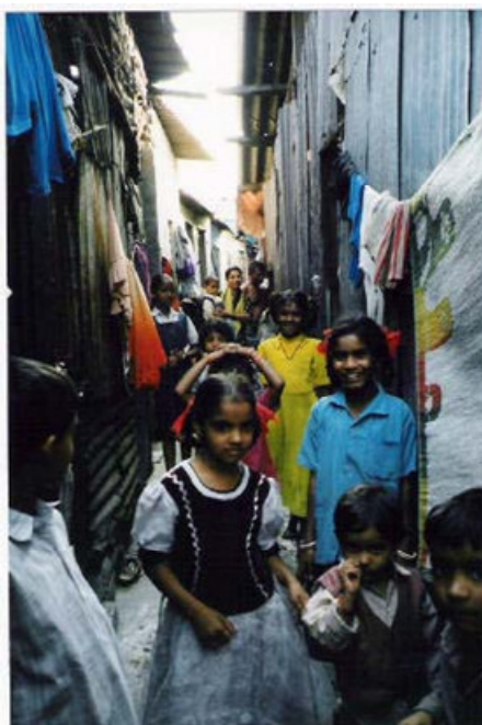
Figure 4. Lane in the study area.

(zopadis) constructed largely of wooden planks, cane, bamboo and occasionally, brick and tiles or of single-room flats in concrete buildings called (chawls), each of which contains about 20 - 25 rooms. The area is very much congested and has no amenities worth mentioning. Drinking water facility in the study area is very poor. Many of them do not have their own water taps. Common