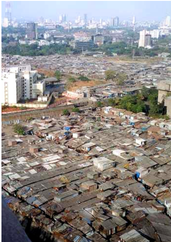
Figure 1. Profile of the study area.