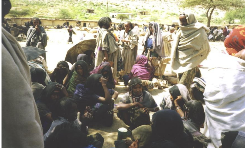
Figure 1. The Afar people interact with other cultural groups in the local market.

major economic decisions of purchasing and marketing of proceeds. Although women are excluded from major decision-making and control limited resources, they make decisions and have control on the income from sales of milk products and skins. With reduced herd sizes, the quantities of these products are decreasing and thus the role of women in their control is also decreasing. There are cases where women own some animals but they cannot make major decisions, such as how to dispose them without the husbands' permission.