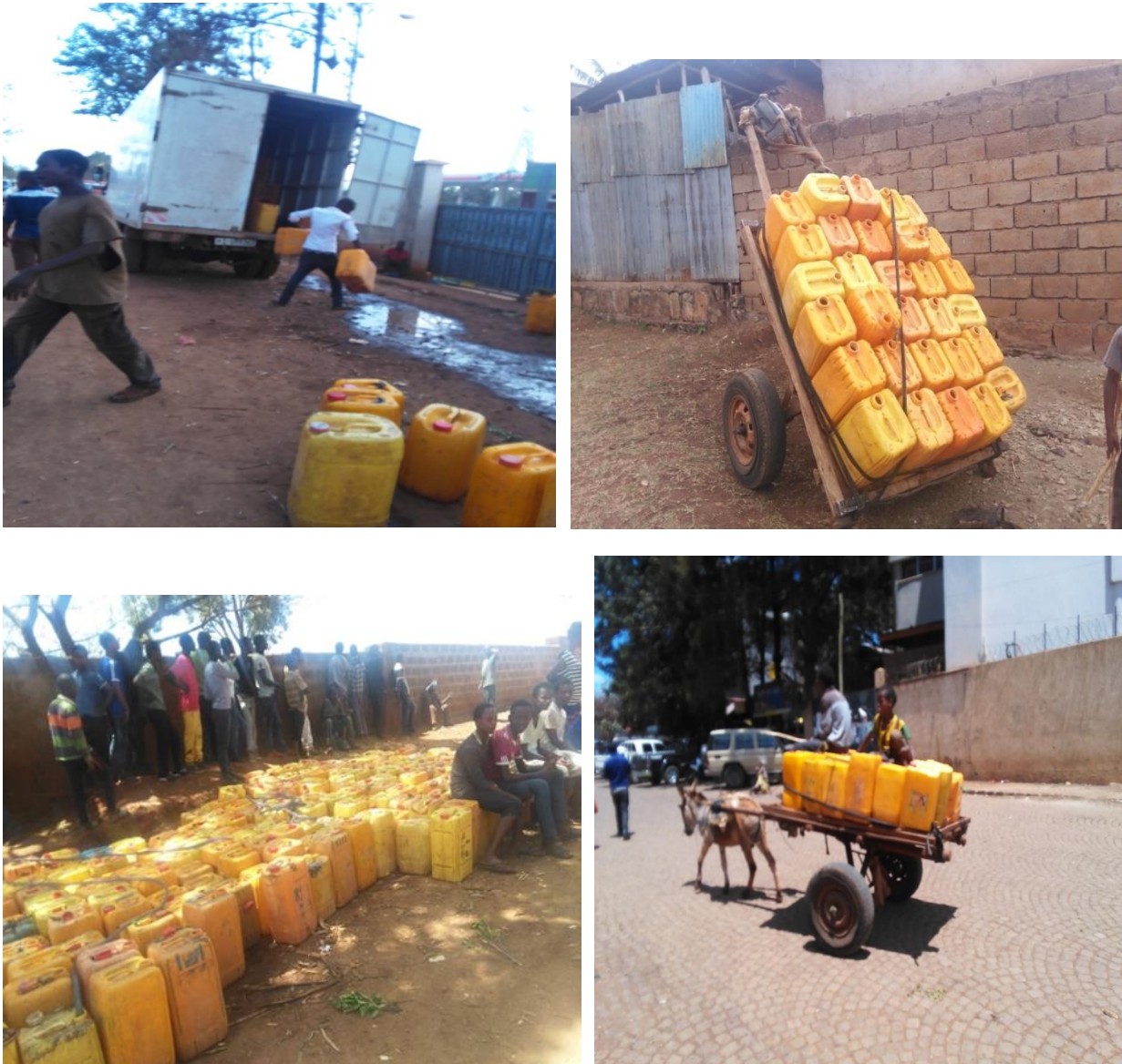
Figure 2. Fetching water from public taps (2015).

rather some consumers take disproportionate amounts of water and the poor is the first victim of the problem (Bereket, 2006).