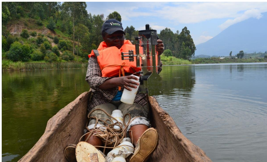
Plate 1. A technician taking water samples on Lake Chahafi in a dug-out canoe.