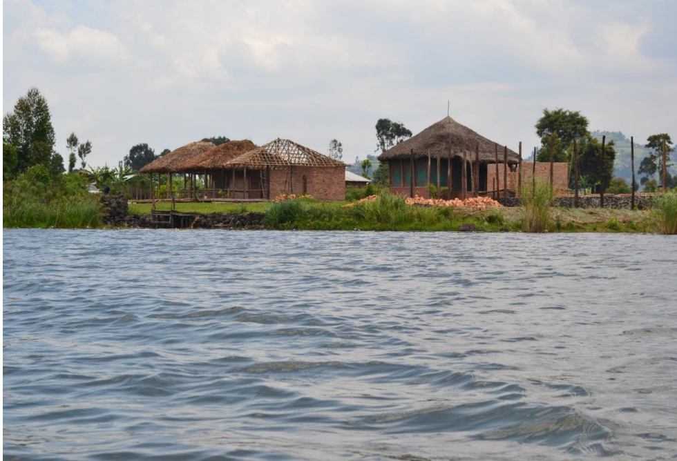
Plate 4. Construction of a new hotel on Lake Mutanda.

changes in the environment/pollution (Elias et al., 2014). Furthermore, Kaul and Pandit (1981) stipulate that the presence of macro-invertebrate species indicates the suitability of the environment for its growth and development, and the absence of any species does not necessarily indicate the unsuitability of the environment, but, the absence of an entire group/order of species indicates adverse environmental conditions for instance pollution.