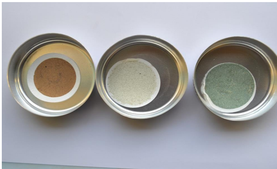
Plate 2. Filtering phytoplankton using 0.45 \mu\text{m} pore size Whatman GF/C filter.