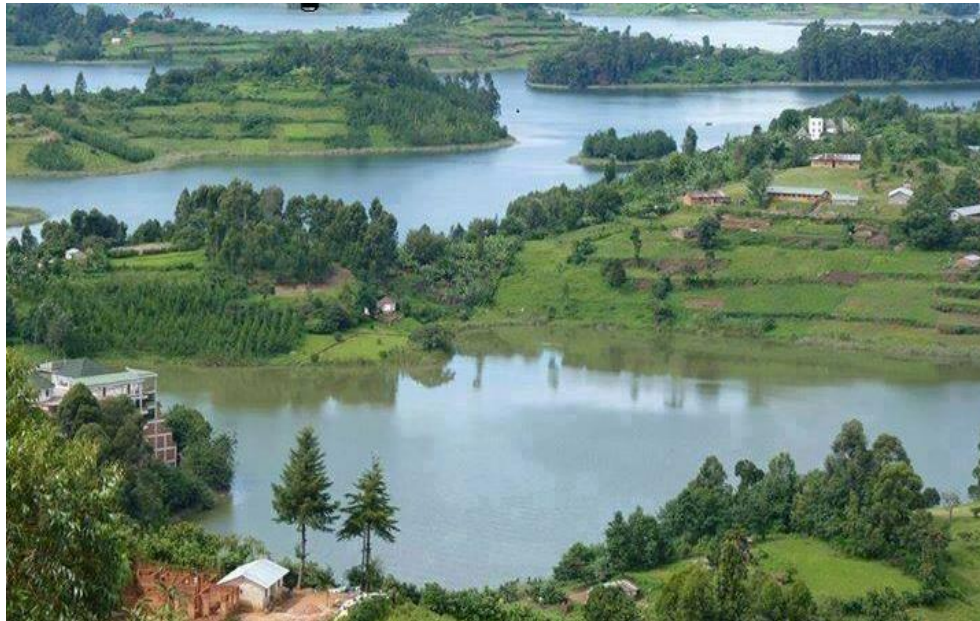
Plate 3. Lake Bunyonyi and developments thereon.

Green (1976), have not been encountered in the current study.