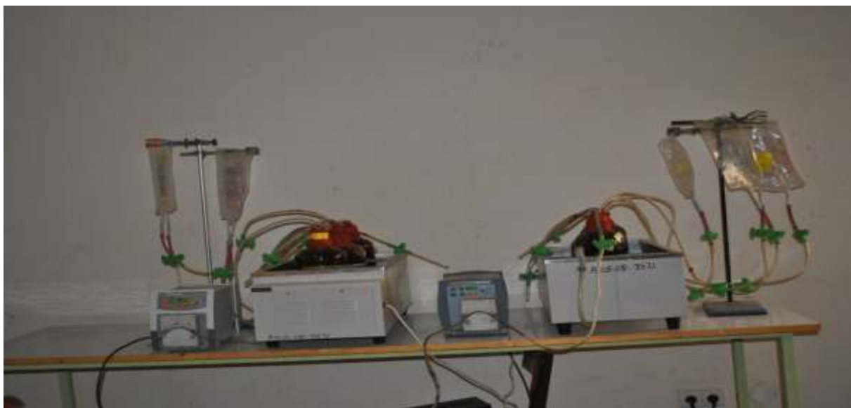
Figure 2. The two-stage ASBR set up.