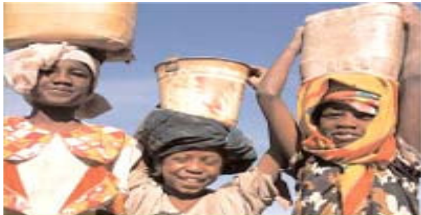
Figure 2. Water collection as a daily need for some people.