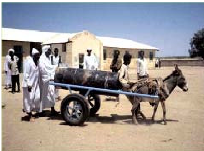
Figure 3. A typical donkey-drawn water tank used by water vendors.

3. Low rainfall woodland Savannah: Covers about 27% of the area of Sudan with rainfall less than 900 mm, with a nine-month dry period. Annual grasses are dominant. Heavy clay soils lie on the east of the Nile and the west is sandy. Most of the 36 million feddans of rain-fed agriculture and the 4 million irrigated lands fall within this heavily populated belt.