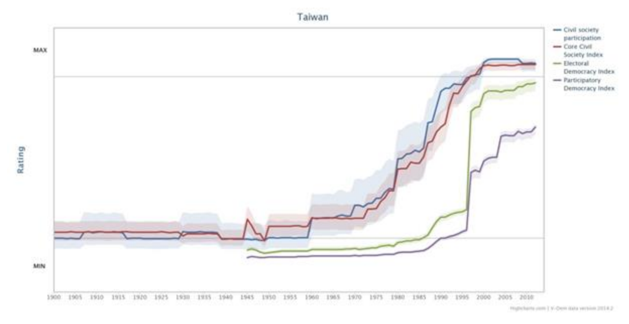
Figure 4. Civil society and democratization development in Taiwan (Source: Graph generated from Varieties of Democracy (V-Dem) online analysis in https://v-dem.net/DemoComp/en/, accessed on Feb. 2, 2015).

development, represented by electoral and participatory democracy in the graph below, with sharp upward growth in 1996 marked by the first direct presidential election. The evolution of state-society relations in Taiwan also tells the story of a democratizing Taiwan.