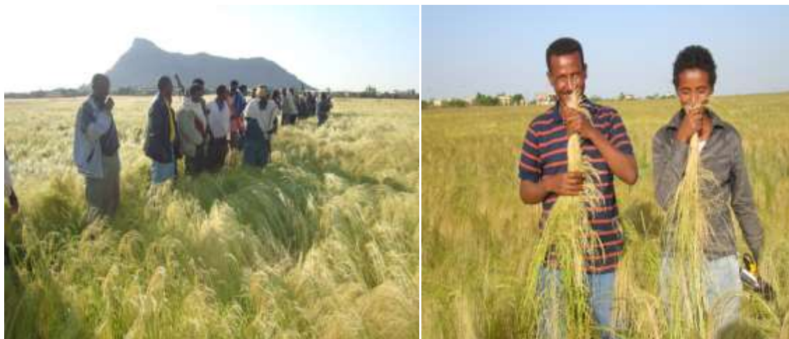
Figure 2. Quncho tef variety performance at farmer's field at Laelay Adyabo, 2012/13 production season. Sources: Photo recorded with the researchers during the field day (November, 2013)