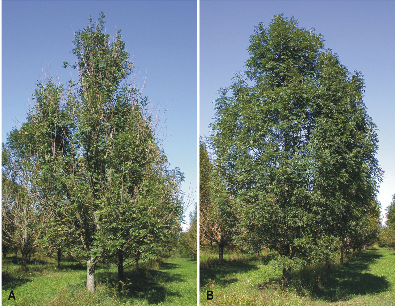
Figure 3. Differences in the intensity of ash dieback between F. excelsior clones in the seed plantation in Feldkirchen an der Donau (17 August 2011): A. Ramet of the most severely damaged clone (number 8), B. Ramet of one of the least damaged clones (number 14) with virtually no dieback symptoms. In both 2009 and 2010 ramets of this clone were also hardly affected by early leaf shedding and remained densely foliated until early autumn.

inspired by the 6-class dwarf mistletoe rating system (Hawksworth et al., 1996), and designation of the particular seven classes used for the ratings (Figure 2) contribute in our opinion to meet the three criteria mentioned previously (accuracy, easy application and comparability). All ratings in the seed plantation were done by the same person (C. Freinschlag), which should have a positive influence on data quality and guarantee comparability of assessments at various dates.