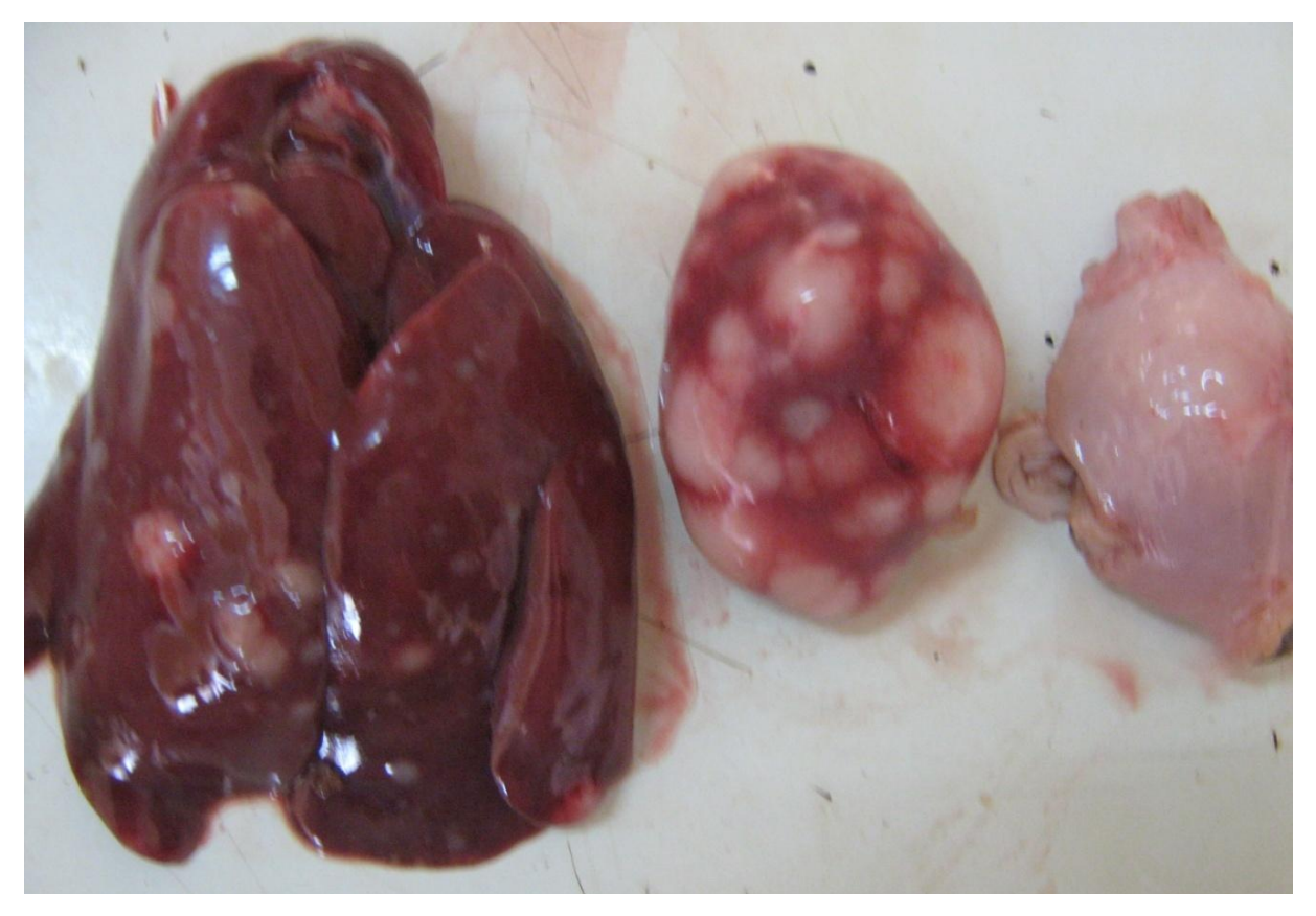
Figure 2. From left to right: whitish nodular neoplastic growths in the liver and spleen and enlarged proventriculus in MD infected 17 week-old commercial layer chicken.