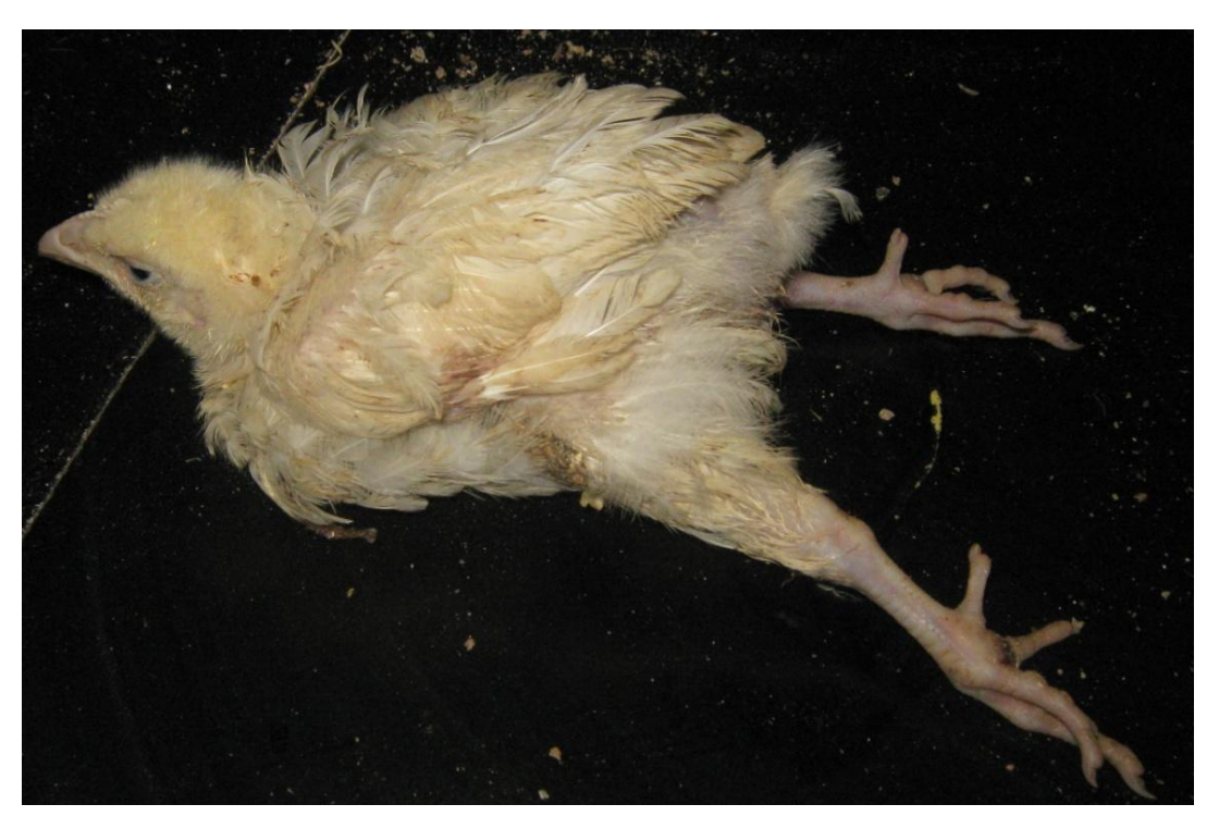
Figure 3. MD affected 3 week-old pullet showing bilateral leg paralysis.