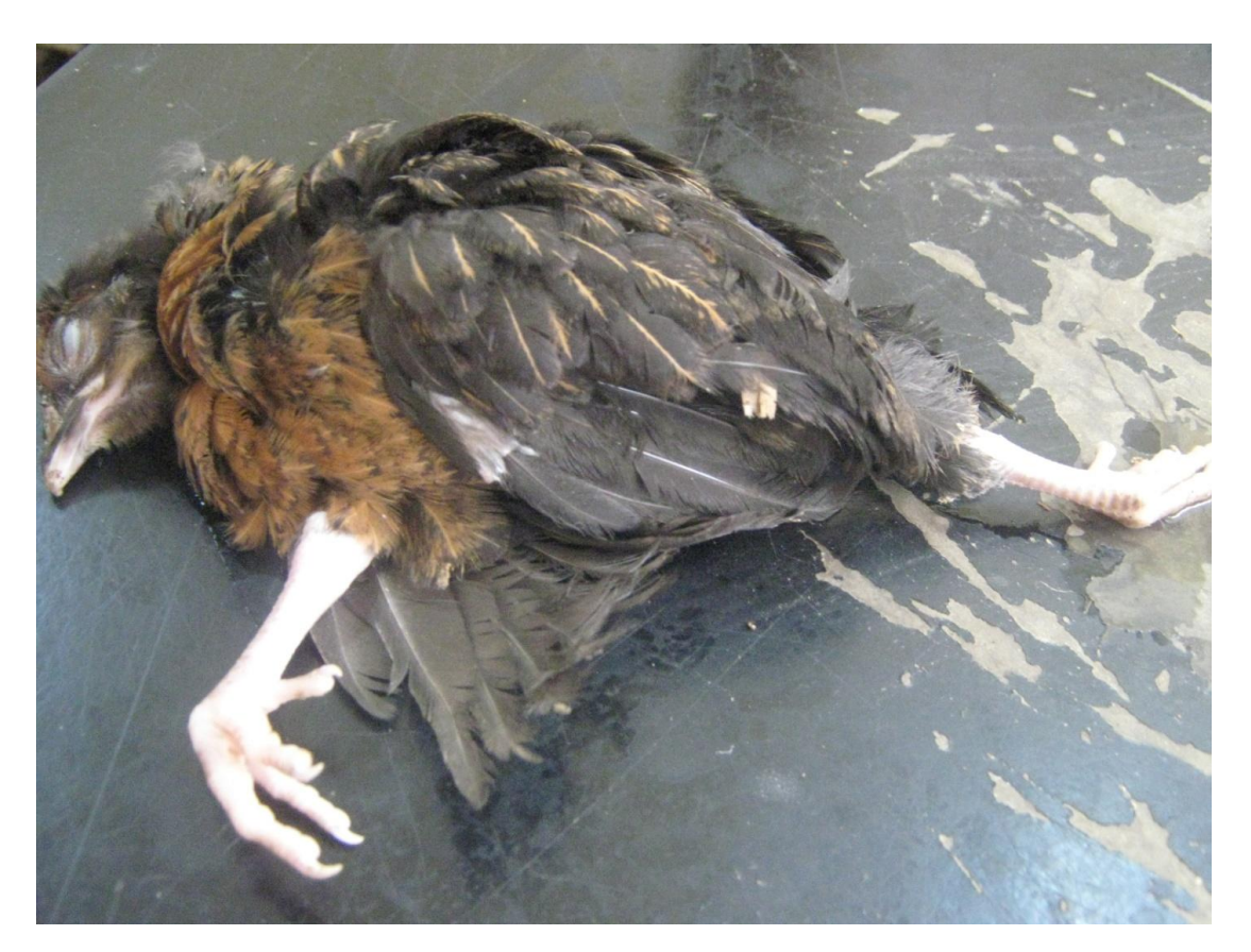
Figure 1. Marek's disease infected 6 week-old commercial chicken showing leg paralysis and ruffled feathers.