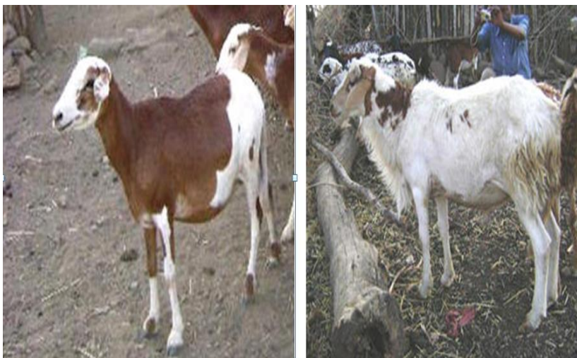
Figure 2. Gumuz sheep female (left) and male (right).