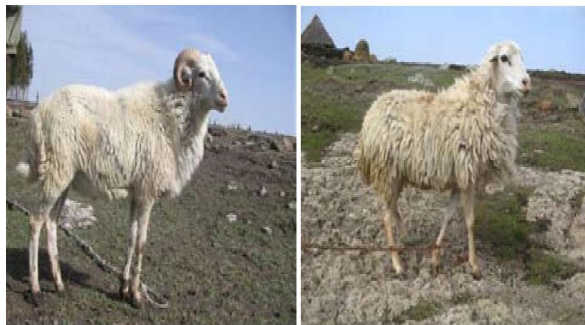
Figure 10. Menz sheep male (left) and female (right).