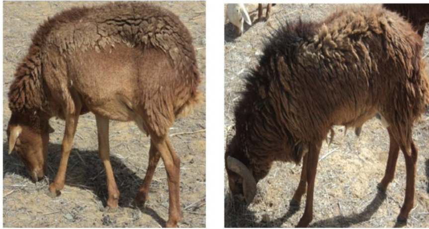
Figure 5. Highland sheep female (left) and male (right).