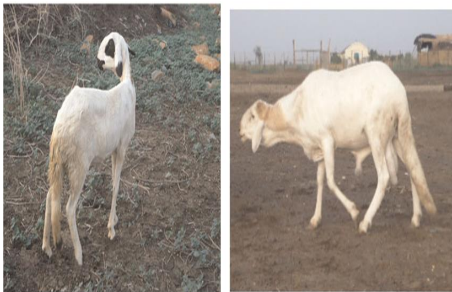
Figure 1. Begait sheep female (left) and male (right).