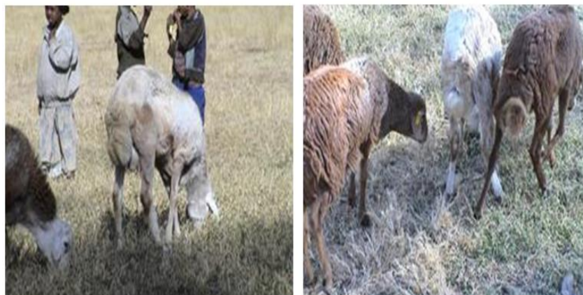
Figure 14. Washera sheep male (left) and female (right).