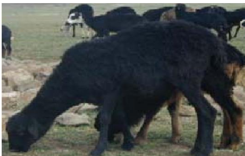
Figure 12. Tikur sheep.