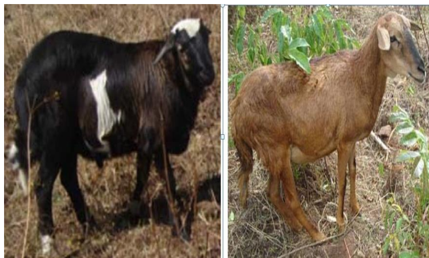
Figure 9. Bonga sheep male (left) and female (right).