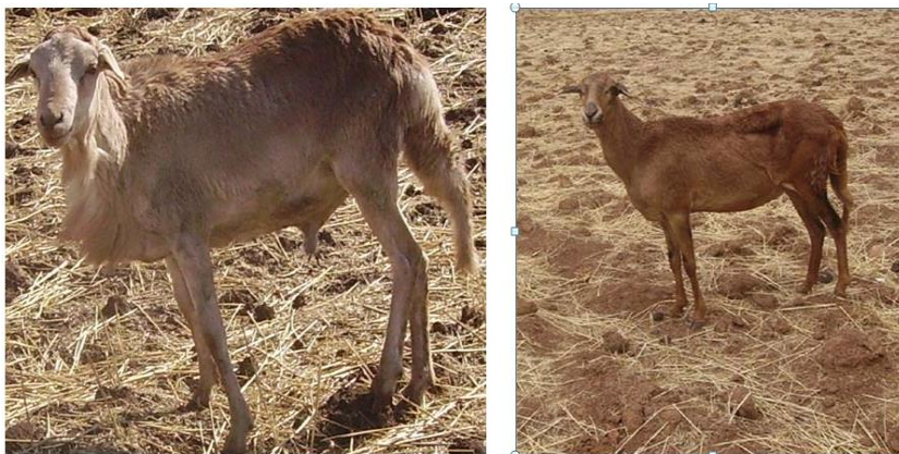
Figure 8. Horro sheep male (left) and female (right).