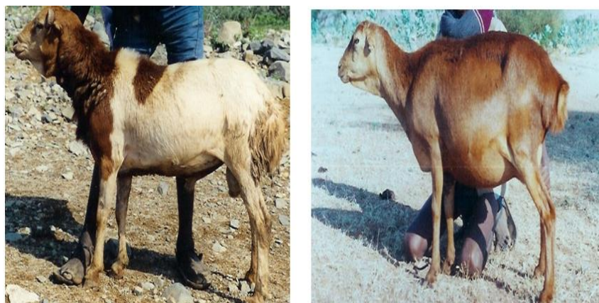
Figure 4. Abergelle sheep male (left) and female (right).