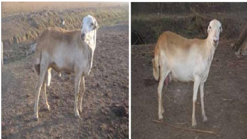
Figure 11. Afar sheep male (left) and female (right).