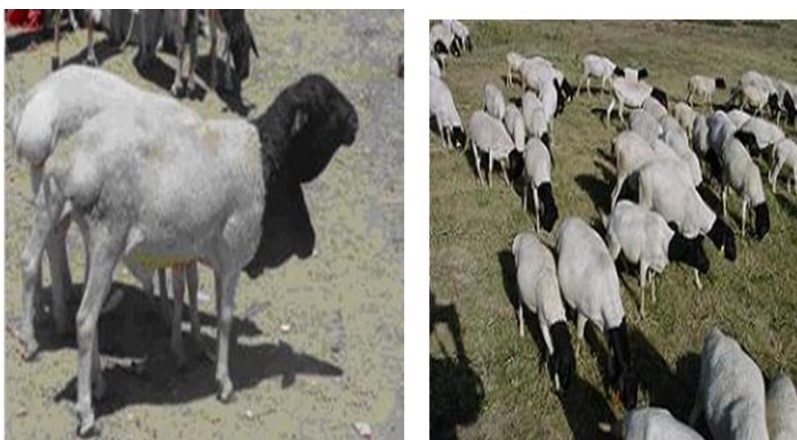
Figure 13. Black Head Somali (BHS) sheep male (left) and flock (right).