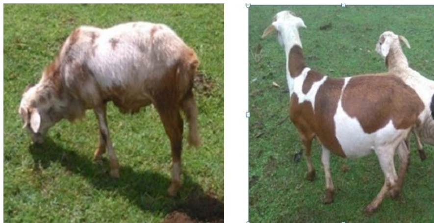
Figure 7. Arsi-Bale sheep male (left) and female (right).