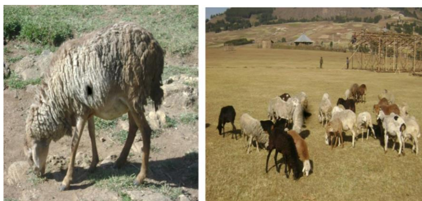
Figure 3. Farta sheep female (left) and flock (right).