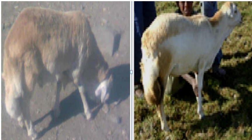
Figure 6. Elle sheep male (left) and female (right).