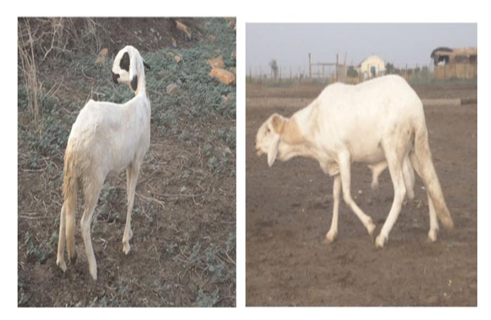
Figure 1. Begait sheep female (left) and male (right).

Table 4. Overall flock Physical body characteristics of sheep breeds of Ethiopia.