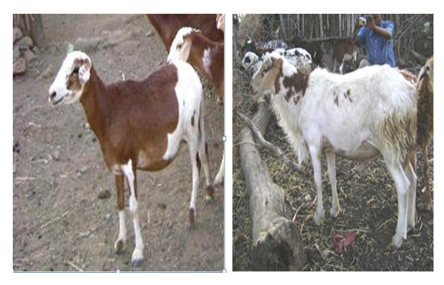
Figure 2. Gumuz sheep female (left) and male (right). Source: Abegaz et al. (2011).