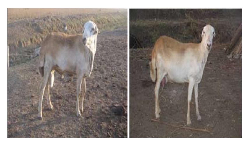
Figure 11. Afar sheep male (left) and female (right).