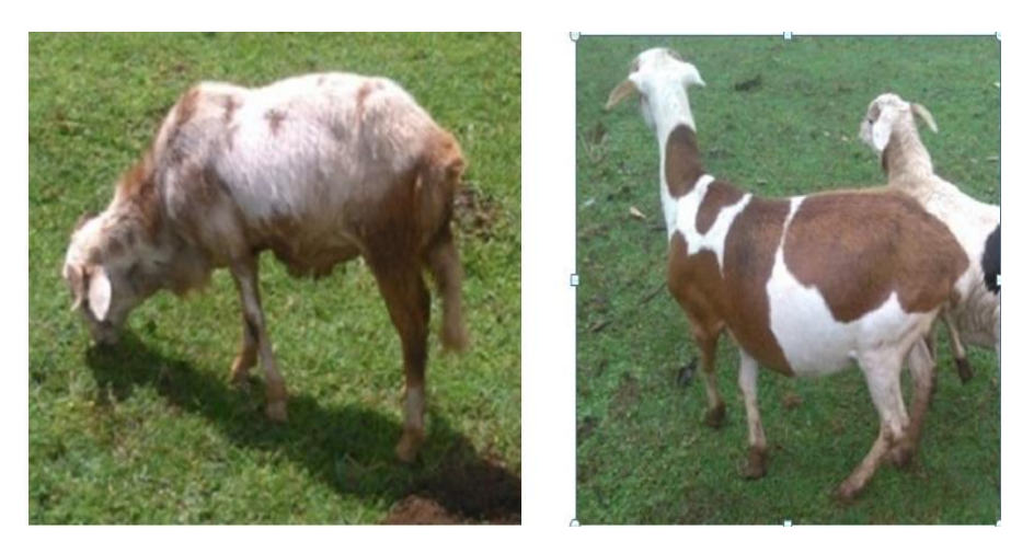
Figure 7. Arsi-Bale sheep male (left) and female (right).