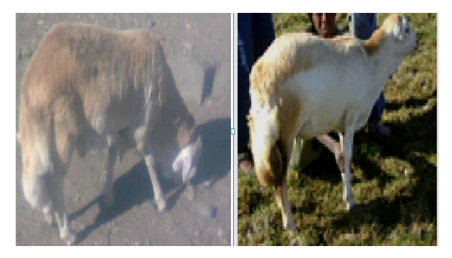
Figure 6. Elle sheep male (left) and female (right).