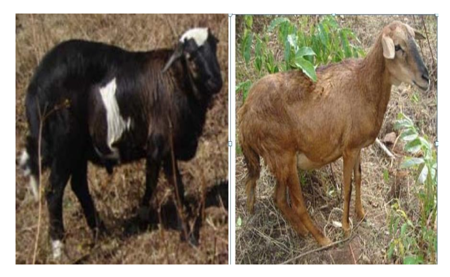
Figure 9. Bonga sheep male (left) and female (right).