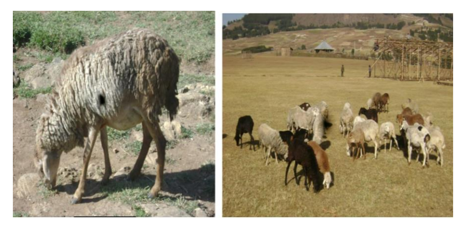
Figure 3. Farta sheep female (left) and flock (right).