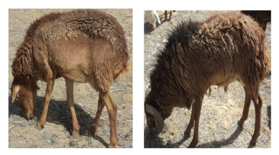
Figure 5. Highland sheep female (left) and male (right).