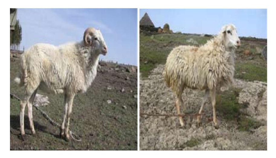
Figure 10. Menz sheep male (left) and female (right).