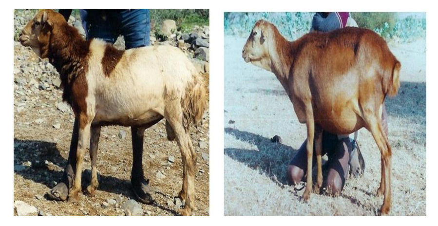
Figure 4. Abergelle sheep male (left) and female (right).