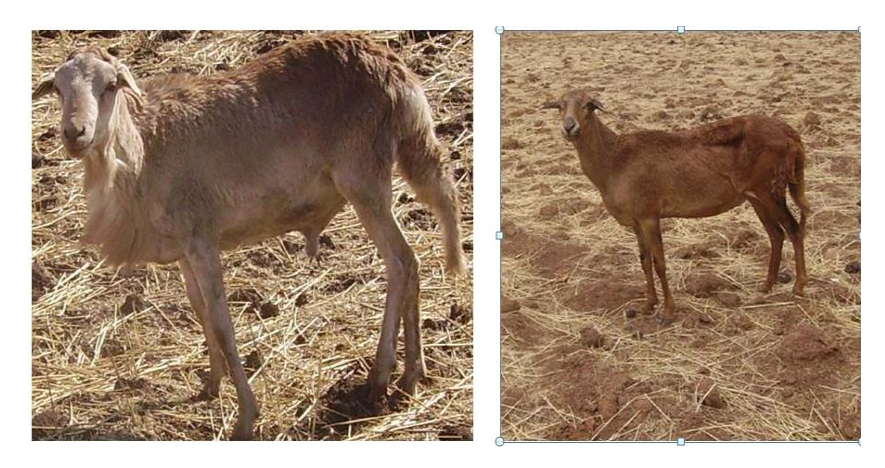
Figure 8. Horro sheep male (left) and female (right). Source: Zewdu (2008).