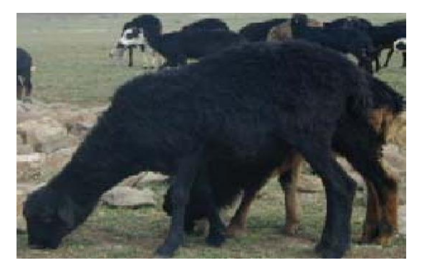
Figure 12. Tikur sheep.