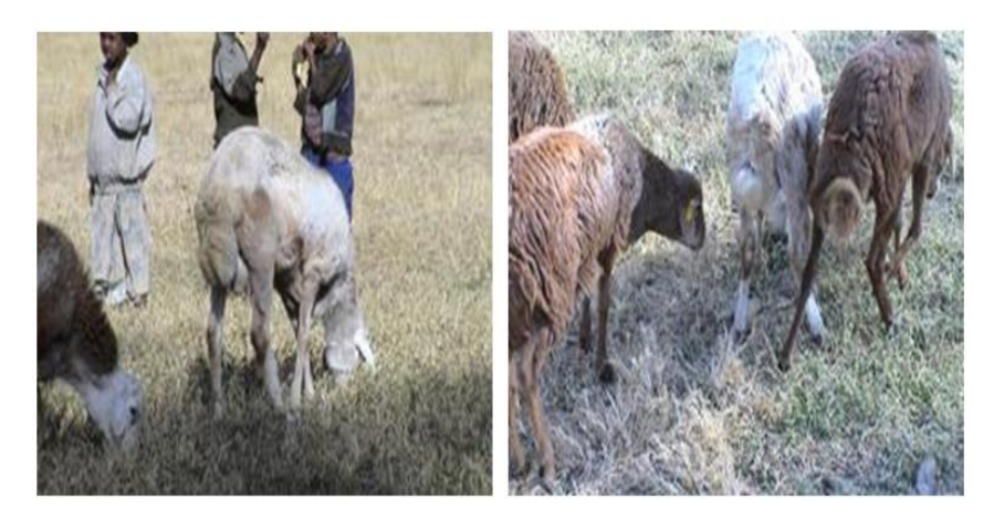
Figure 14. Washera sheep male (left) and female (right).