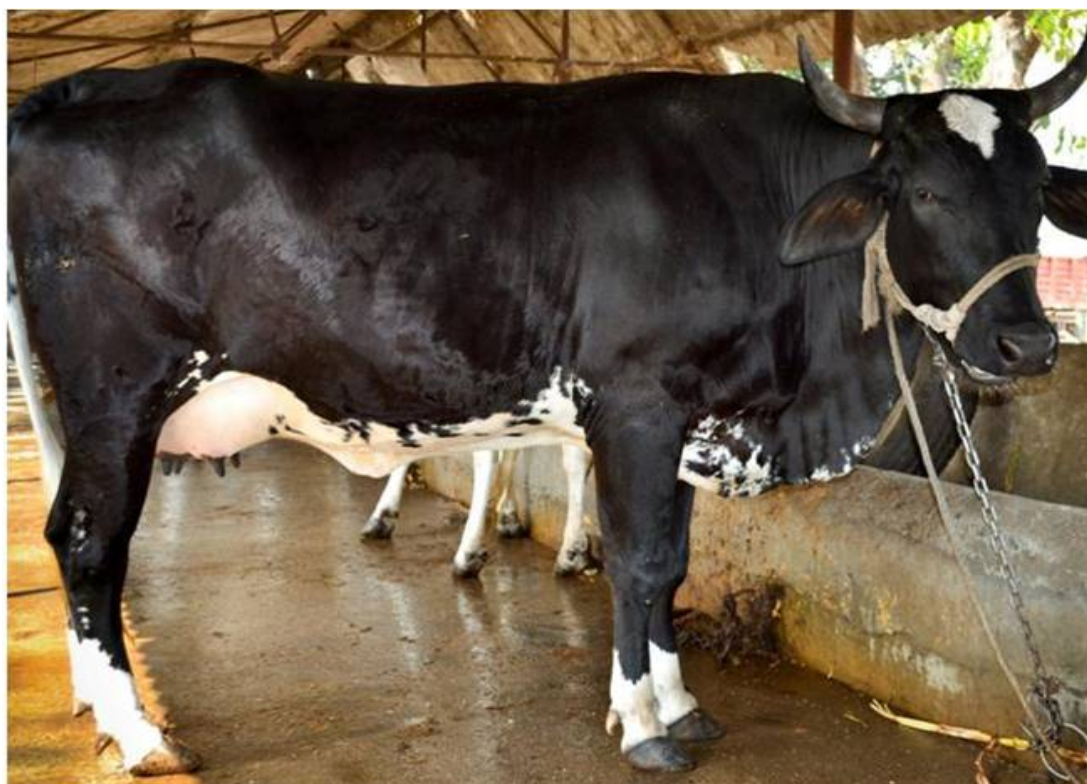
Figure 2. Atypical representative of HF x Deoni crossbred cow at CCBP, MAU.