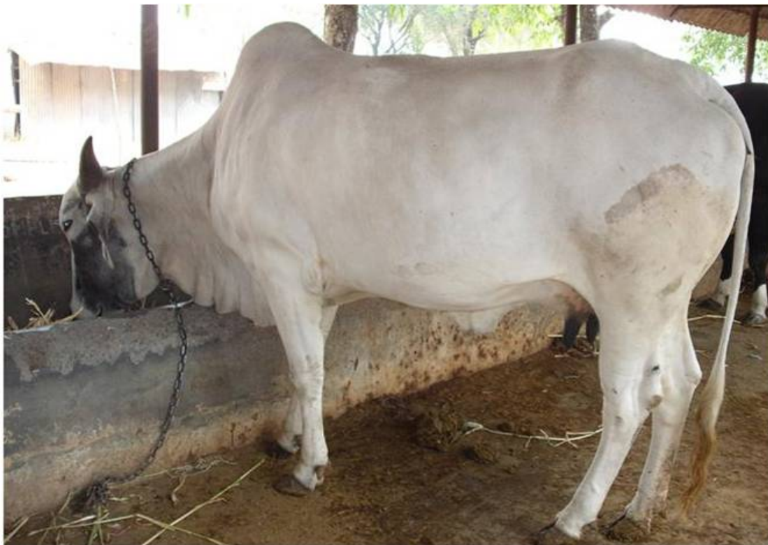
Figure 1. Atypical representative of a Deoni cow at CCBP, MAU.