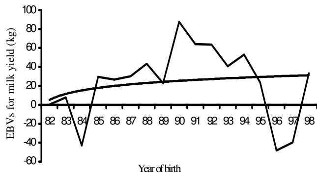
Figure 1. The genetic trend for milk yield.

information so generated will be useful in the future direction of the cross breeding programme for the genetic improvement of the local cattle population.