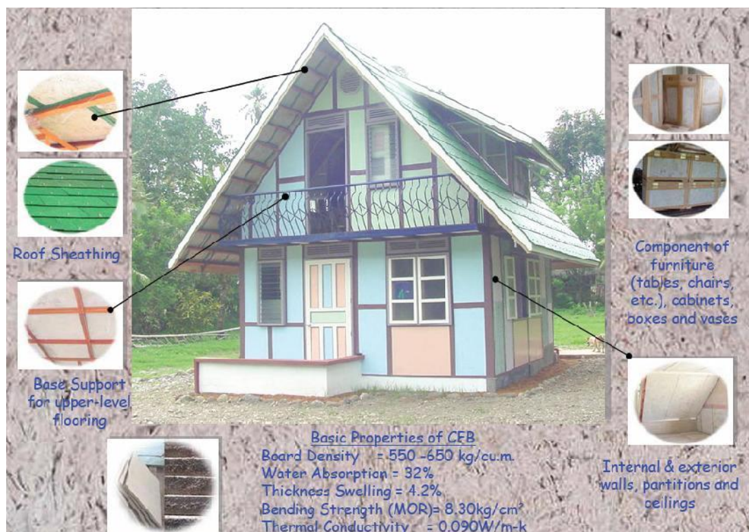
Figure 4. Applications of coconut fibre boards in house construction and other utilities (Luisito et al., 2005).

It is used for internal and exterior walls, partitions and ceiling. It can also be used as a component in the fabrication of furniture, cabinets, boxes and vases, among others.