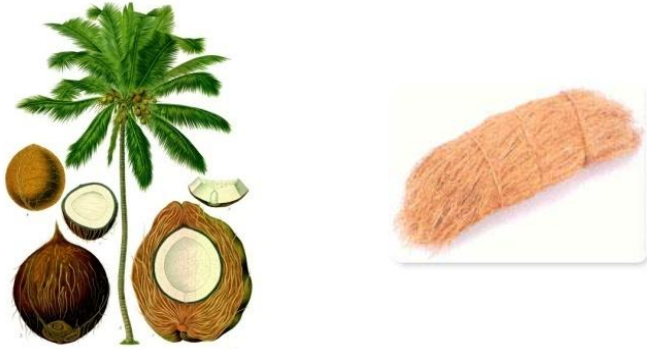
Figure 1. Coconut tree, coconut and coconut fibres.