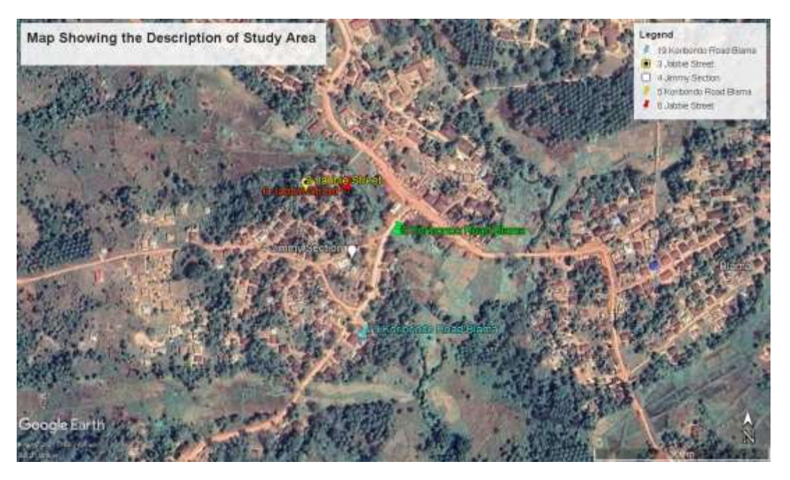
Figure 1. A map showing the area of study.