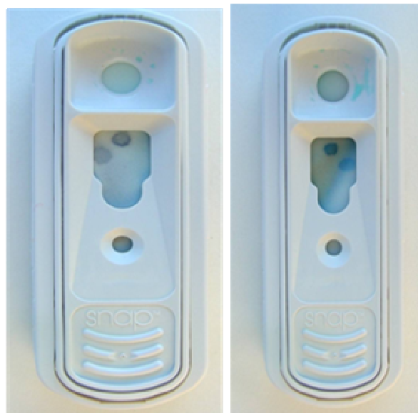
Figure 6. Positive test of the FIV antibodies (on the left) and of the FeLV antigen (on the right).