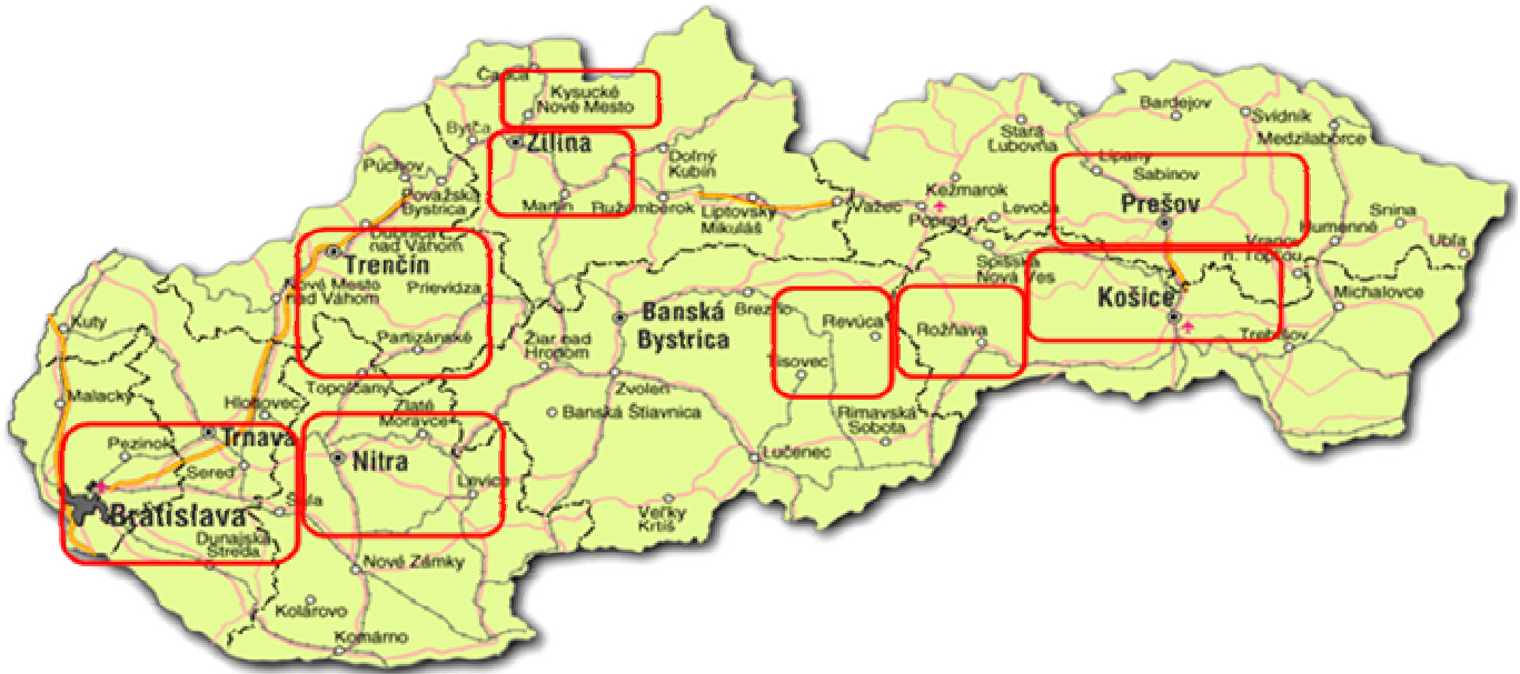
Figure 1. Districts of the epizootiological-serological survey on FIV, FeLV and toxoplasmosis prevalence in cats in the Slovak Republic.