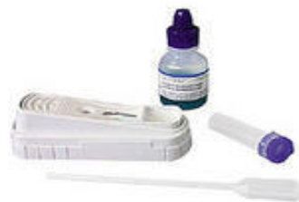
Figure 3. SNAP COMBO TEST FeLV Ag / FIV Ab for detection of FeLV antigen and FIV antibodies (Drugs.com, 2009).