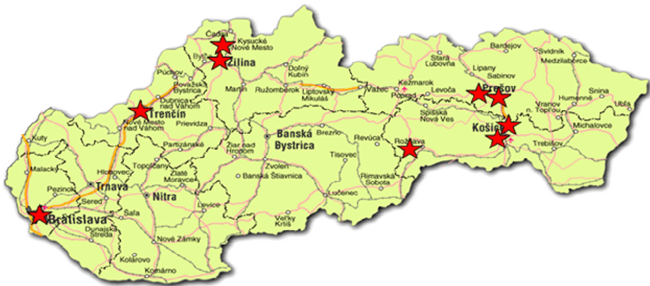
Figure 2. The localities of feline AIDS occurrence in the Slovak Republic.