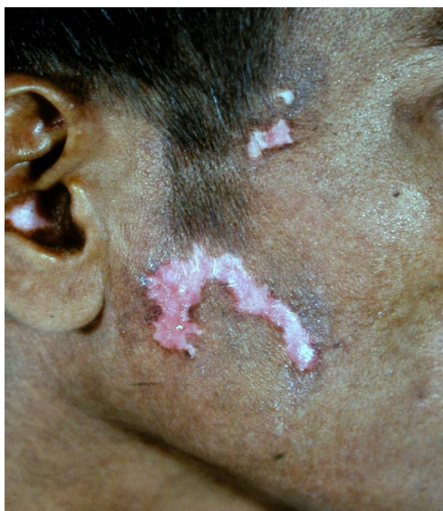
Figure 2. The photograph shows DLE lesions on the face of the patient studied.

smoking, viral infection and trauma, based on the fact that all these factors affected patient's immunological status (Greenwood, 1968; Sontheimer, 1996; Costenbader et al., 2004).