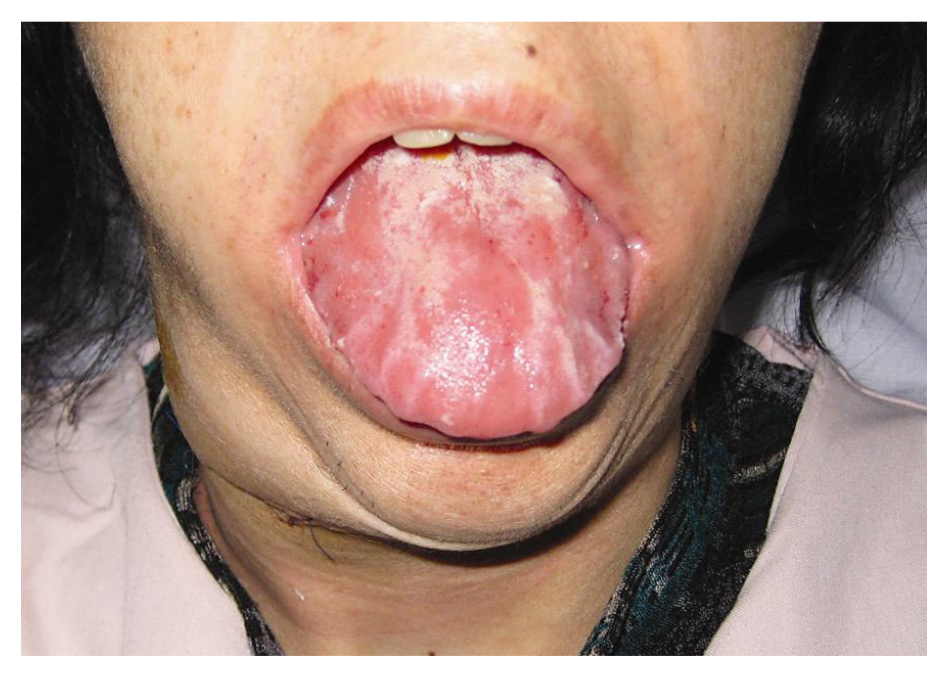
Figure 1. Macroglossia and lateral scalloping of the tongue from impingement on the teeth.