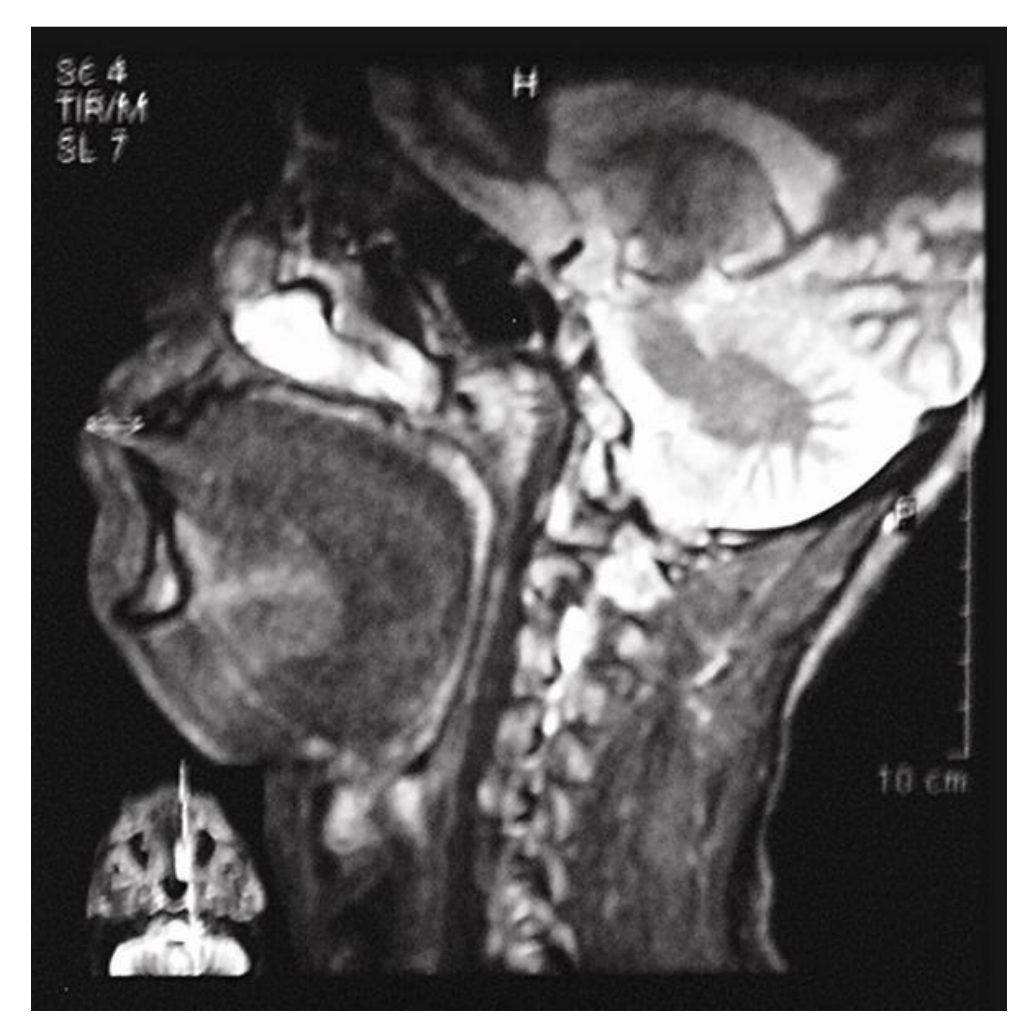
Figure 3. Narrowing of the upper airway due to base of tongue enlargement.

anti SS-A, anti SS-B and ACE levels were evaluated. However, all mentioned tests were in the normal range. Moreover, to rule out Sjögren's disease, we biopsied lower lip minor salivary glands and the result was also negative. However, erythrocyte sedimentation rate (ESR) was higher than normal; about 32 mm/h.