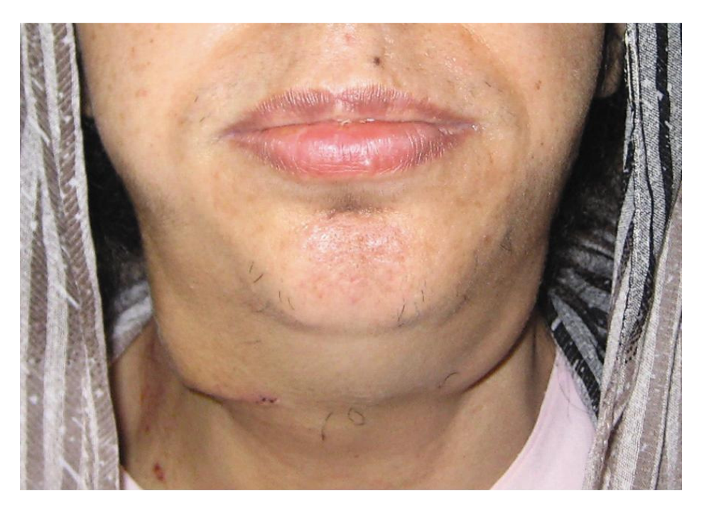
Figure 2. Bilateral enlargement of submandibular region.

examination macroglossia and lateral scalloping of tongue were obvious (Figure 1) and both submandibular glands seemed to be diffusely enlarged (Figure 2). The base of tongue was enlarged and narrowed her airway consequently (Figure 3). Incisional biopsy and Congo red