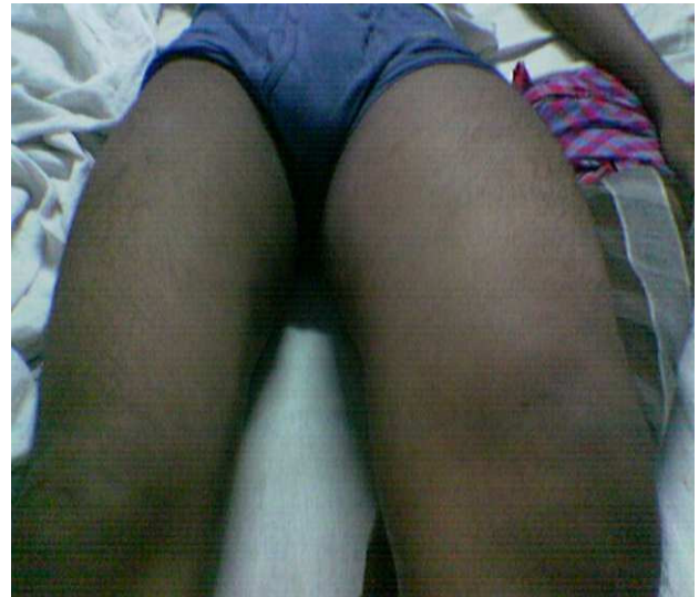
Figure 3. A young male showing calf muscles edema after hair dye ingestion