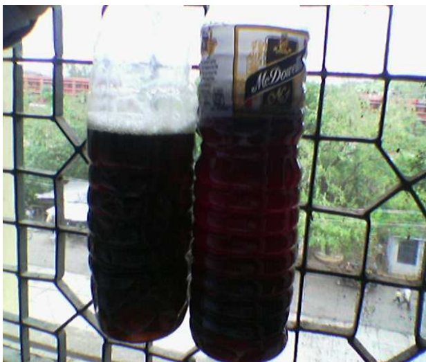
Figure 2. Urine samples collected in plastic bottles showing cola coloured urine suggestive of myoglobinuria after hair dye.