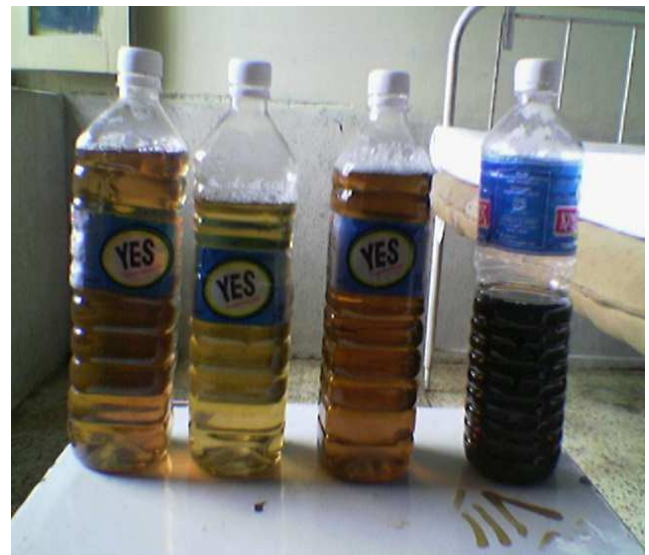
Figure 4. Changing pattern of urine colour after hair dye ingestion as time passes. Bottles from right to left shows collected urine samples on day 1,2,3,4.