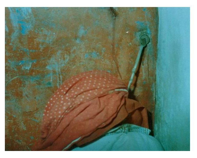
Figure 5. Hanging support in the case 4

alone and used to hang the key of her house on her neck. She would have slipped on the door step while opening the door. According to the medico-legal point of view, unconsciousness or panic after the slip would explain the victim's inability to straighten herself up.