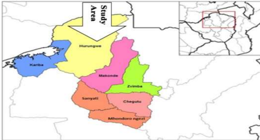
Figure 1. Study area.