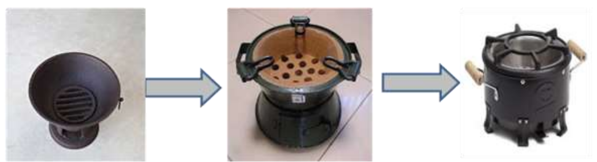
Metal charcoal stove