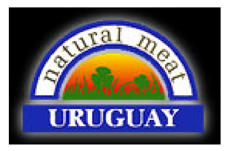
Figure 2. Logo "country brand".