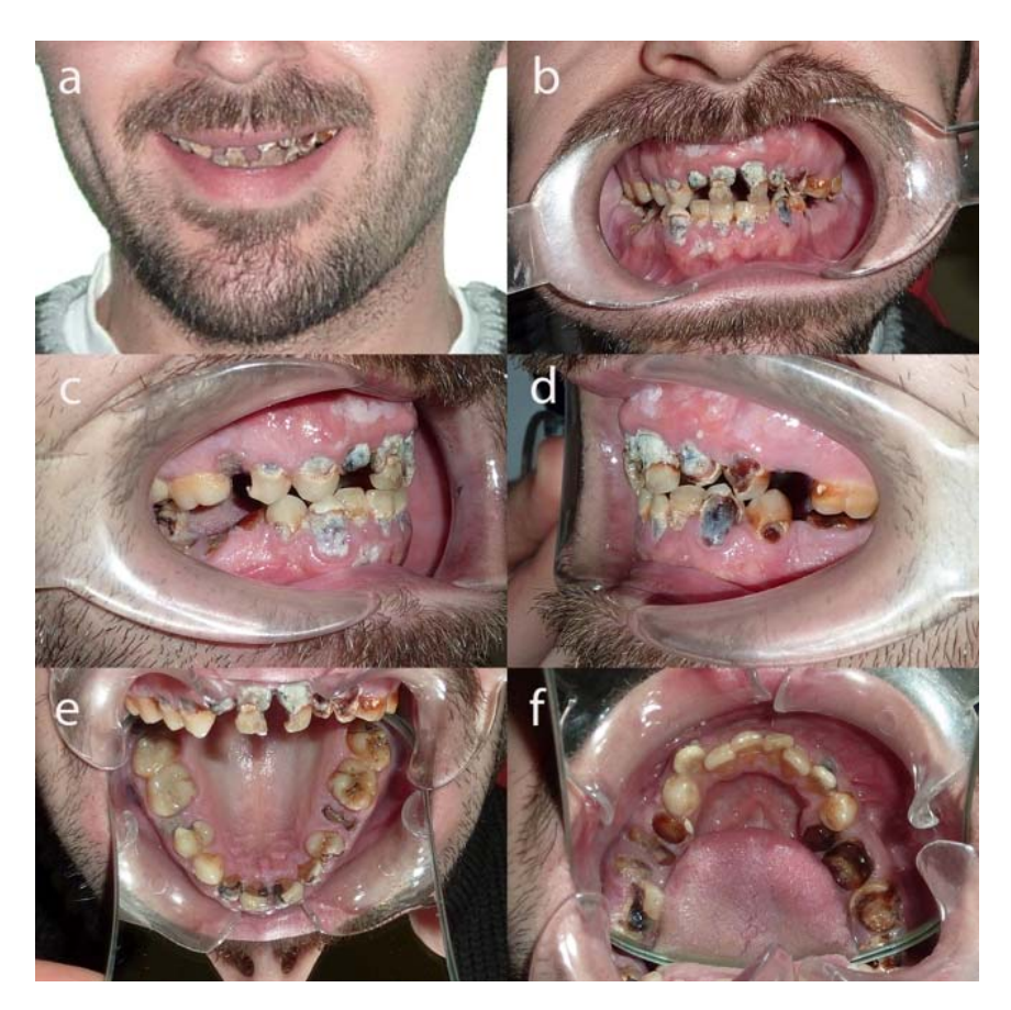
Figure 1. Dental images before prosthodontic treatment. (a) Aesthetic appearance of the teeth lost. (b) The image after Erosion occlusion of the maxilla and mandible. (c) The occlusion to the right of the image. (d) Occlusion of the left image. (e) Detailed image of the maxilla. (f) Detailed image of the mandible.

There are two factors increasing the risk of tooth decay related to excessive soft drinks. These factors will lead to changes in pH. Sugar is easily fermented by bacteria in the mouth (Kleinberg, 2002). Phosphoric acid in coke weakens the tooth enamel and increases the risk of caries (Tahmassebi et al., 2006). However, the high sugar concentration prepares an appropriate environment for bacteria (Marsh, 2003). The effect of diet on dental tissue can be affected by a number of factors such as corrosive acid environment and hot drinks (Wongkhantee et al., 2006). Related to many of these variables, limited information is available (Ganss et al., 2012).