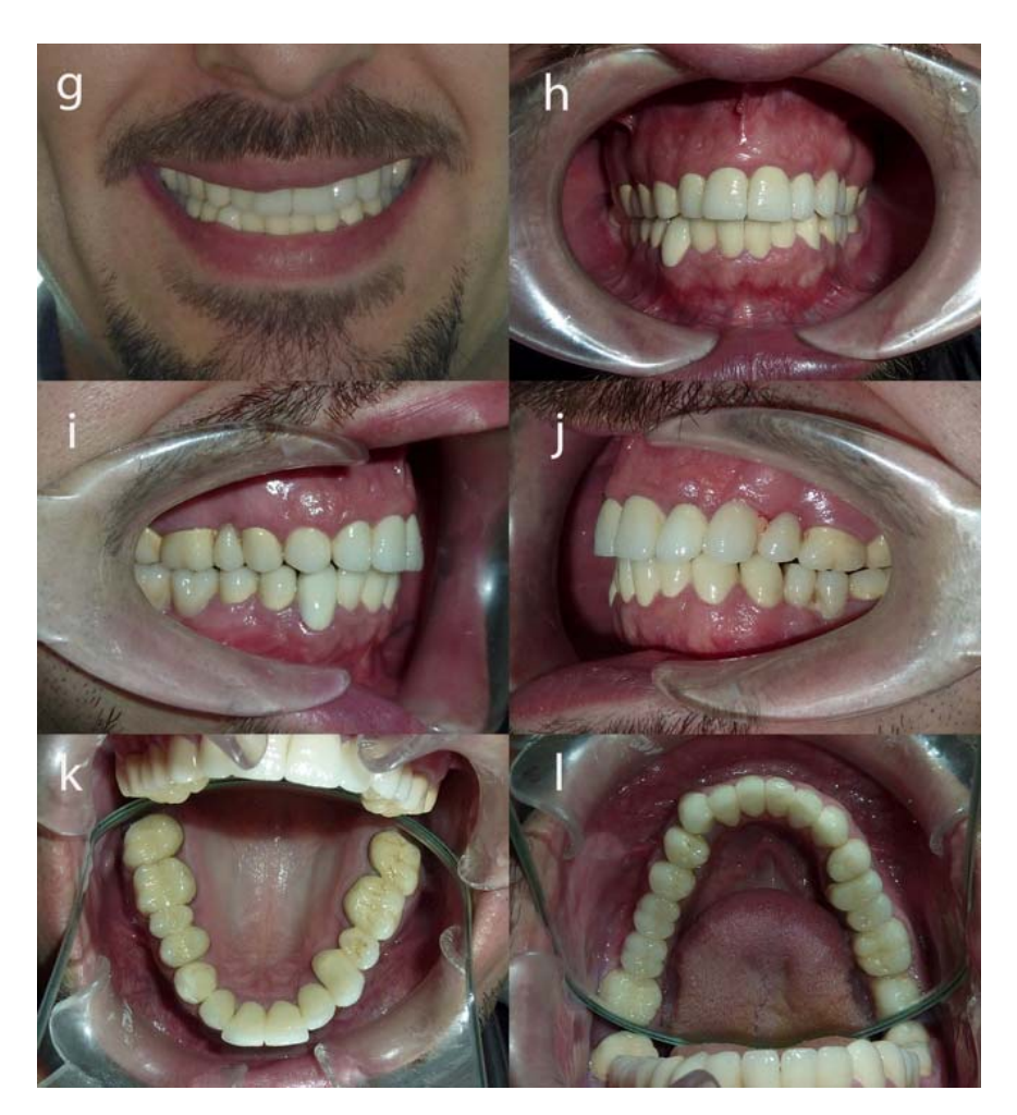
Figure 4. Dental images after 2 year the prosthodontic treatment. (a) The patient's aesthetic design image. (b) Treatment of anterior images. (c) Closing the right image after the treatment. (d) Closing the left image after the treatment. (e) Detailed image of the maxillary teeth after treatment. (f) Detailed image of the mandibular teeth after treatment.

teeth including 11, 12, 21, 22, 34, 43, and 45 and extraction was required for teeth 15, 25, 36, 46, and 47 that couldnot be saved. In the unhealthy teeth, there were apical lesions and periodontal withdrawal. After rootcanal treatment of teeth, post-operative follow-up examination revealed no complication and uneventful recovery. Post-core treatment was performed on the root canal of the teeth. Prosthodontic treatment was planned. Because of the aesthetic requirements of anterior regions, the zirconium-enabled ceramic crowns were performed on anterior teeth, while metal-ceramic crowns and bridges were performed on the posterior teeth (Figure 4).