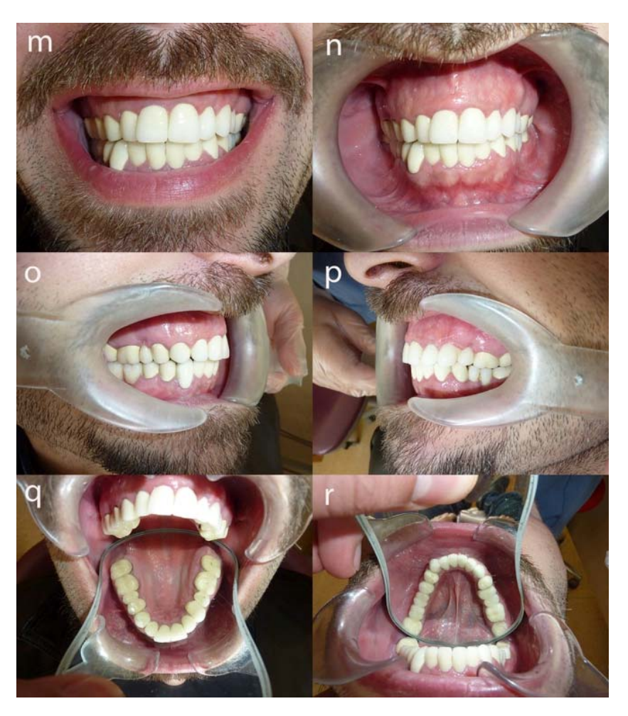
Figure 5. Dental images after 5 years the prosthodontic treatment. (a) 5 years after the patient's aesthetic image. (b) Monitoring the relationship of occlusion and periodontal. (c) The closure of the image from the right. (d) The closure of the image from the left. (e) Follow-up post-the image of the maxillary teeth. (f) Follow-up post-the image of the mandibular teeth.

present a good environment for the bacteria that cause tooth decay (Kitchens and Owens, 2007).