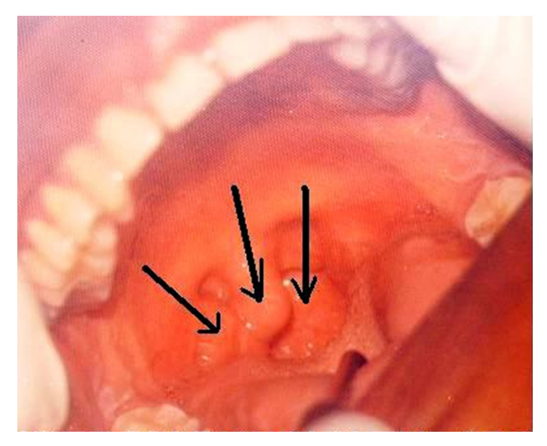
Figure 2. Markedly enlarged uvula and tonsils.