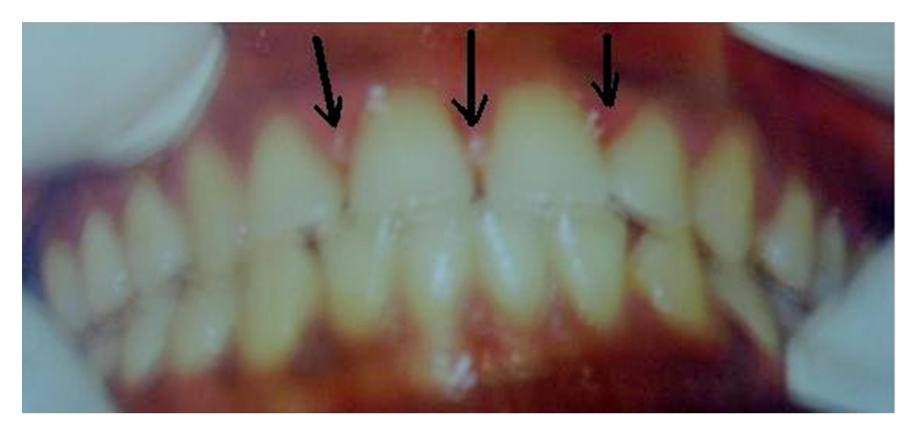
Figure 1. Localized gingivitis limited to maxillary incisors.

patient's own words-naturally leading to a more detailed oropharyngeal examination which revealed very large tonsils compromising a good part of the airway (Figure 2). These findings and the history put together led to a definitive diagnosis of "mouthbreathing -associated gingivitis." After counselling, full mouth oral prophylaxis was performed and oral hygiene instructions given. The patient was then referred to the otolaryngologist. A recall appointment was scheduled to hold after otolaryngological consultation but the patient failed to attend.