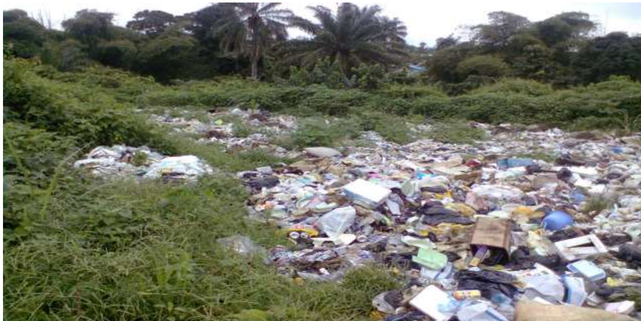
Figure 3. Hospital waste dumpsite.