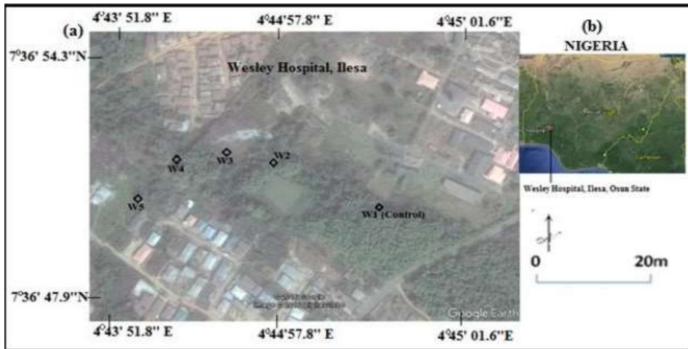
Figure 1. Location of sampling water sites along Ayao Stream.

10-fold dilutions in sterile distilled water were carried out and 1 ml of each dilution was aseptically dispensed in sterile Petri-dishes in duplicates. A volume of 20 ml of molten nutrient agar (Lab M) cooled to 45°C for bacterial population or Malt Extract Agar (Lab M) for fungi was later added to each of the plates. The mixture was allowed to solidify and incubated inverted for 24 to 48 h at 35°C for bacteria. For fungi, the cultured plates were incubated un-invertedly and aerobically at 30°C for 5 to 7 days (until the plates showed no further increase in the number of fungal colonies).