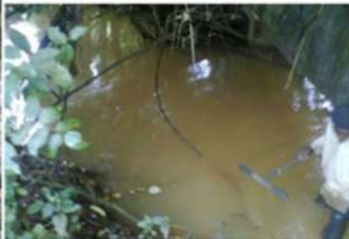
(b). A representative of the sampling points W2 - W5. The locations are covered by vegetation in Figure 1