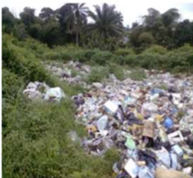
(a) the dumpsite