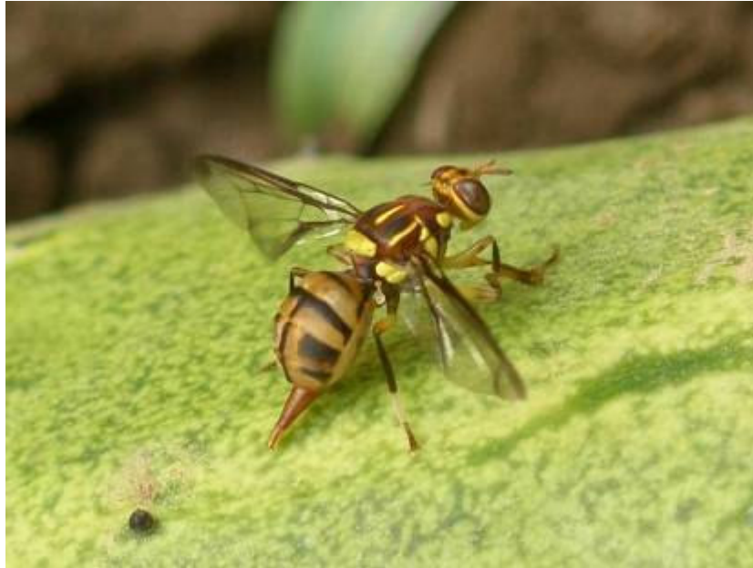
Picture 1. Adult female of cucurbit fruit fly.