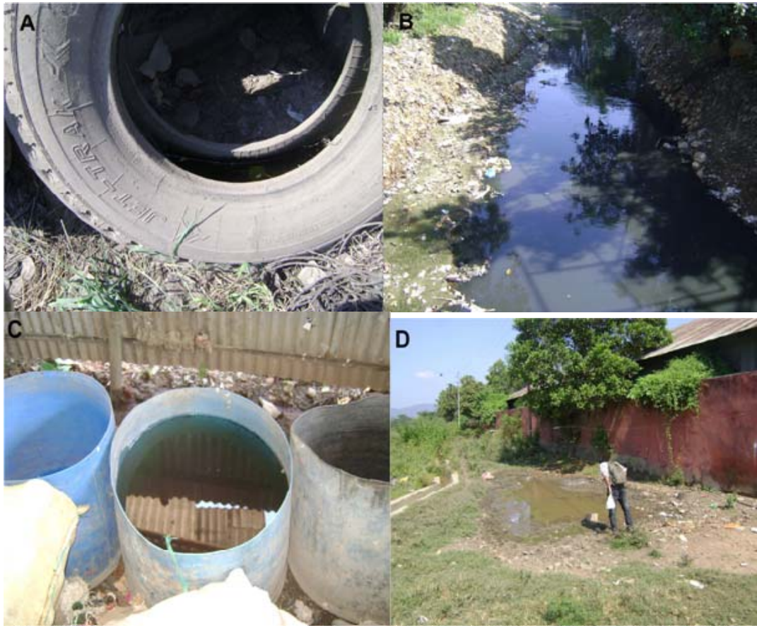
Figure 1. Locations of the survey area in the city of Guwahati, Assam, India.

Rainfall forms surface pools of fresh water which favored mosquito larval development habitats for the major fresh water Anopheles vectors (Ramasamy et al., 1992a,b; Surendran and Ramasamy, 2010). However, excessive rainfall can wash away these larvae and eggs resulting in reduction of the numbers of small puddles thereby temporarily lowering the rates of mosquito borne disease transmission.