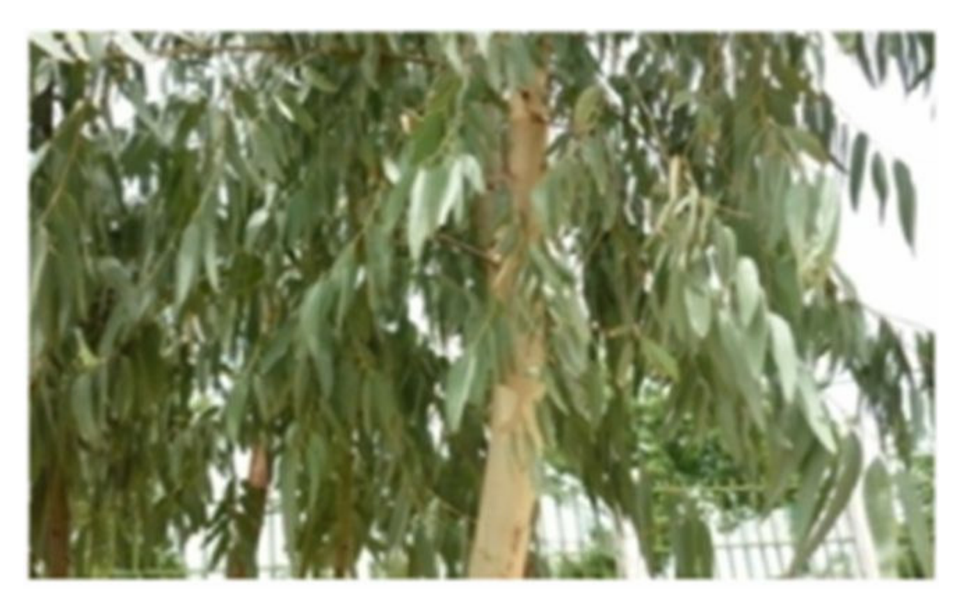
Figure 10. Eucalyptus sp. Location: Maroua (Ward Domayo) Date: 20/12/2009.

or the unripe fruit eaten. The lack of control of dosage is sometimes the cause of an overdose due to high concentrations of toxic compounds in certain species (Rates, 2001). Using this case as control is also indicated by Titanji et al. (2008) in other areas of Cameroon and by Asase et al. (2005) in Ghana. M. Indica is used against headaches and diarrhea (Betti, 2004). The leaves or bark are anti-inflammatory drugs (Burkill, 1985; Oliver-Bever, 1986; Kambu et al., 1989; Das et al., 1989). The tender leaves are used as diuretics (Anon. 5, 1986), for the treatment of hypertension and of infertility (Igoli et al., 2005). According to Das et al. (1989), this species is used to treat dental problems.