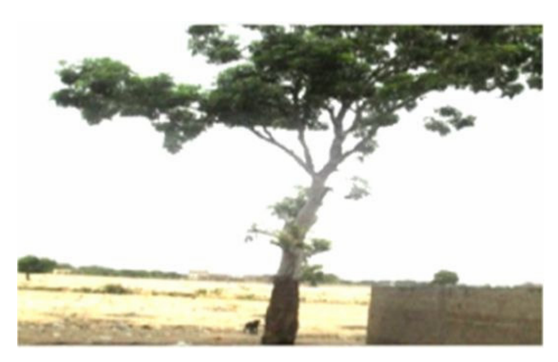
Figure 11. Khaya senegalensis. Location: Maroua (Ward Ouro-Tchede) Date: 27/12/2009.

K. senegalensis (Figure 11) may exceed 2 feet in diameter. Its bark is grayish, dark, scaly leaves are glabrous, paripinnate mainly grouped around the ends of branches with 3 to 7 pairs of leaflets opposite or subopposite. The distribution is from Senegal, Uganda and present eastern Sudan (Kerharo and Adam, 1974).