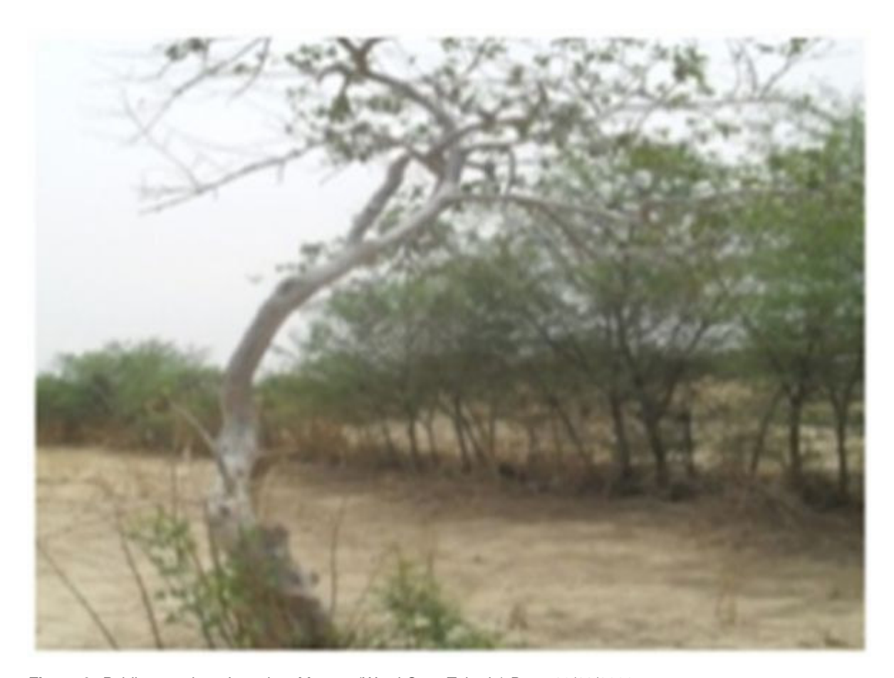
Figure 9. Psidium guajava. Location: Maroua (Ward Ouro-Tchede) Date: 20/12/2009.

green turning yellow when ripe, round or oval and have a pink flesh containing many seeds (Anon. 5, 1986).