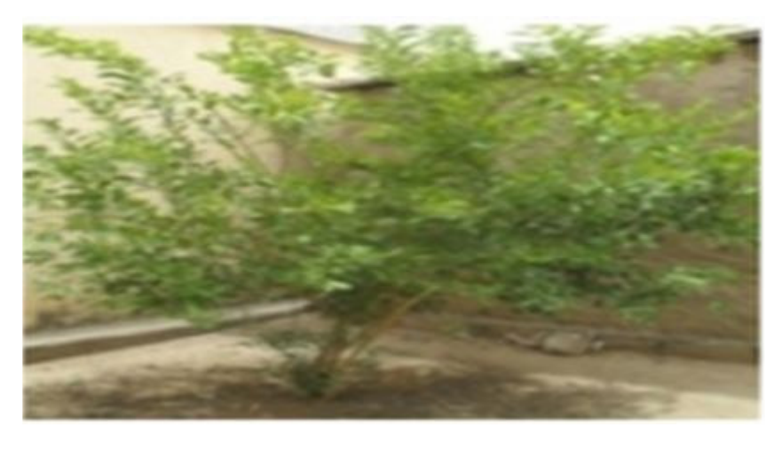
Figure 5. Citrus limonum. Location: Maroua (Ward Ouro-Tchede) Date: 06/12/2009.