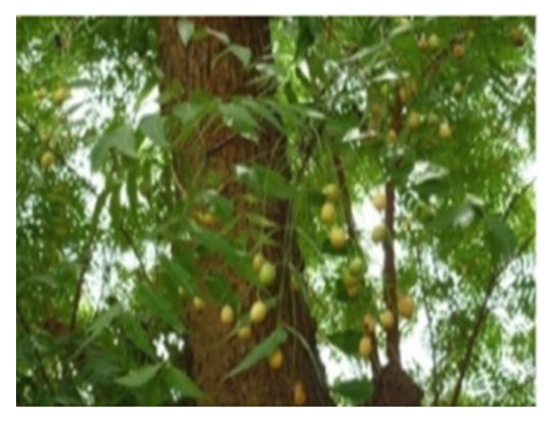
Figure 3. Azadirachta indica L. Location: Maroua (Ward Domayo) Date: 7/12/2009.

bath, or even boiling the leaves of indicators with those of the leaves of A. indica and the filtrate diluted to serve Jatropha gossipifolia and Combretum sp. The local population has no standard dose for administering the extracts from medicinal plants in treating malaria.