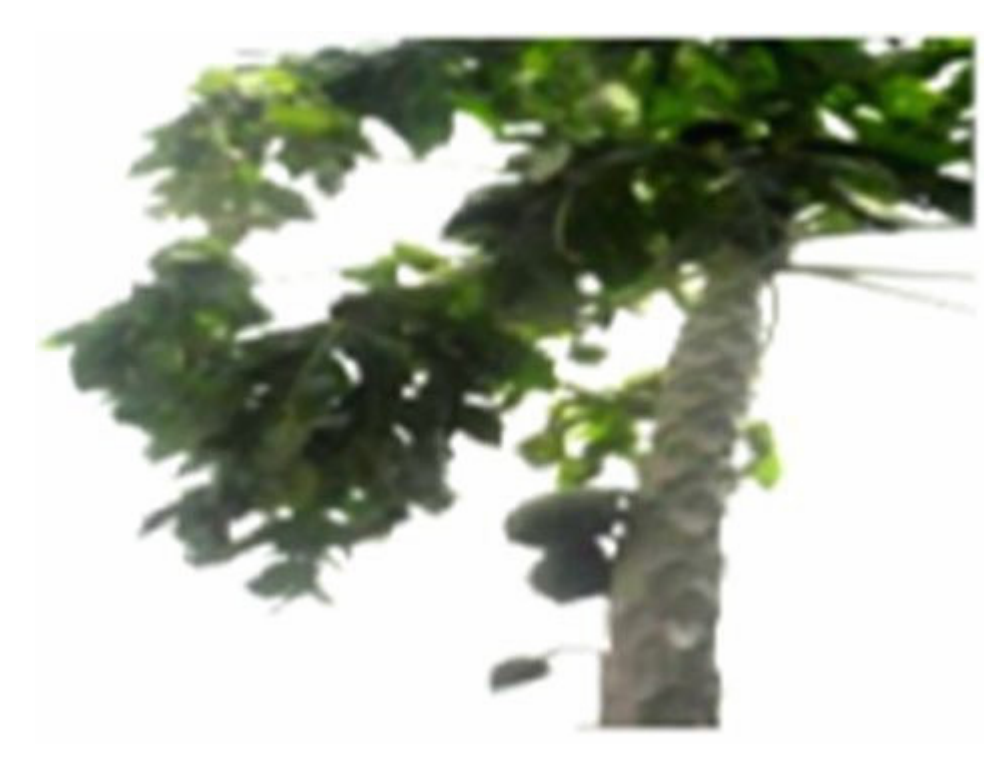
Figure 6. Carica papaya L. Location: Maroua (Ward Ouro-Tchede) Date: 17/12/2009.

family. Its size varies from 2 to 15 m. It is a perennial plant with leathery leaves that adapts to all types of tropical and warm temperate climates. It grows on sandy and clay soils (Anon. 5, 1986).