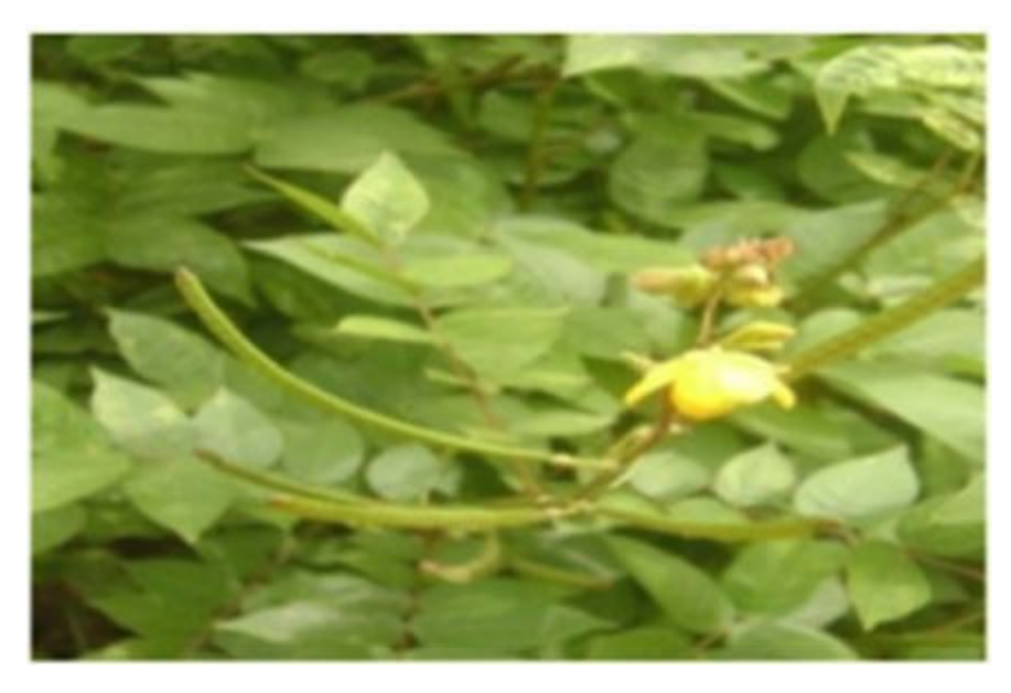
Figure 7. Cassia occidentalis. Location: Maroua (Ward Ouro-Tchede) Date: 11/12/2009.