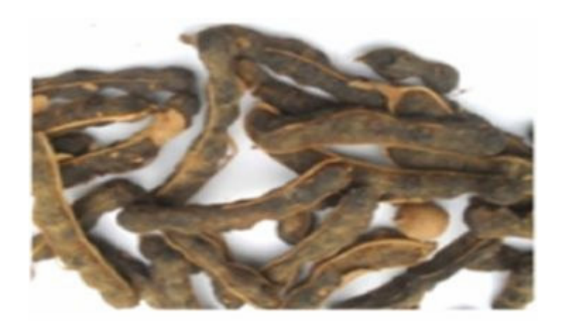
Figure 4b. Fruits of Tamarindus indica.