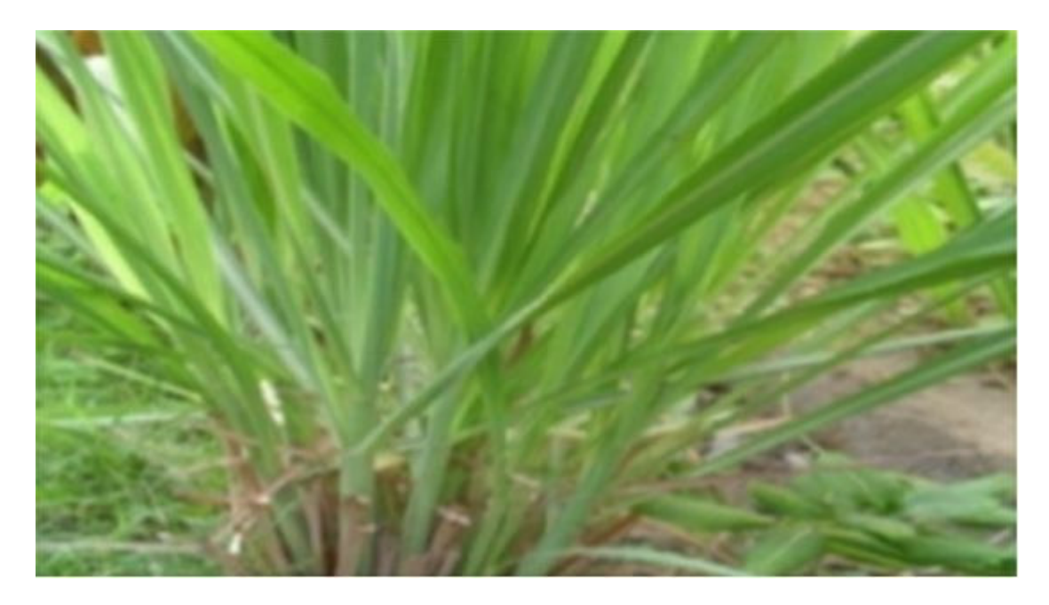
Figure 12. Cymbopogon citratus (D. C) Strapf. Location: Maroua (Ward Ouro-Tchede) Date: 27/12/2009.

families as antimalarial drugs. The top ten most widely used plants by the Maroua people were recorded and described. The Giziga, the Fulbe and Toupouris use these plants much more to treat malaria. Leaves (34%), bark (24%) and roots (18%) are the parts most commonly used to treat malaria. It is important that the scientific community, Governments and donors get involved in the operation of these antimalarial plants which are effective against malaria that plagues our society. Research on active principles present in these plants of the region should be studied in order to spread the results of this work at the national as well at the international level.