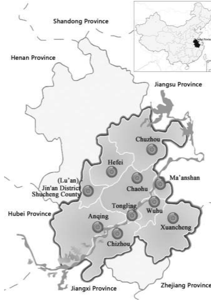
Figure 1. Map of study area.