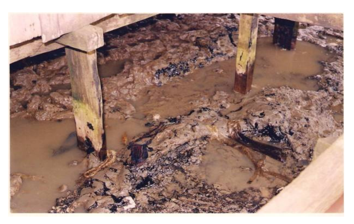
Figure 4. Land degradation and pollution through oil spillage in the region.