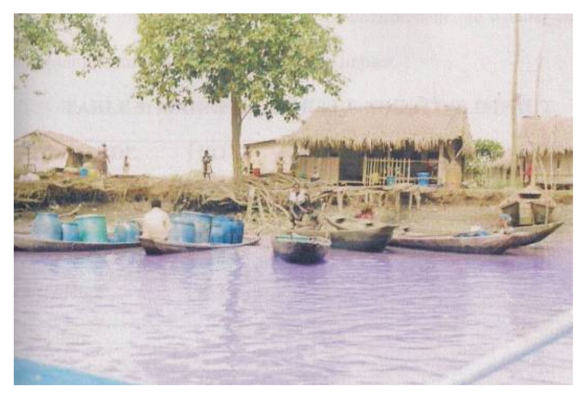
Figure 3. The arrival of Awoye inhabitants from fetching water due to the pollution of water by oil spillage in the area.

The residents in the localities are considered as one of the major stakeholders. For the administration of the questionnaires on the residents, ten (10) communities were randomly selected based on their population size and functions in the coastal area. Stratified random sampling was employed to select the household-heads that were interviewed. In the 10 selected settlements, 20% of the residential buildings in each residential quarters were randomly selected and a household-head was selected for interview. Data collected were qualitatively analysed and presented in simple percentages in tables and reported in the paper.