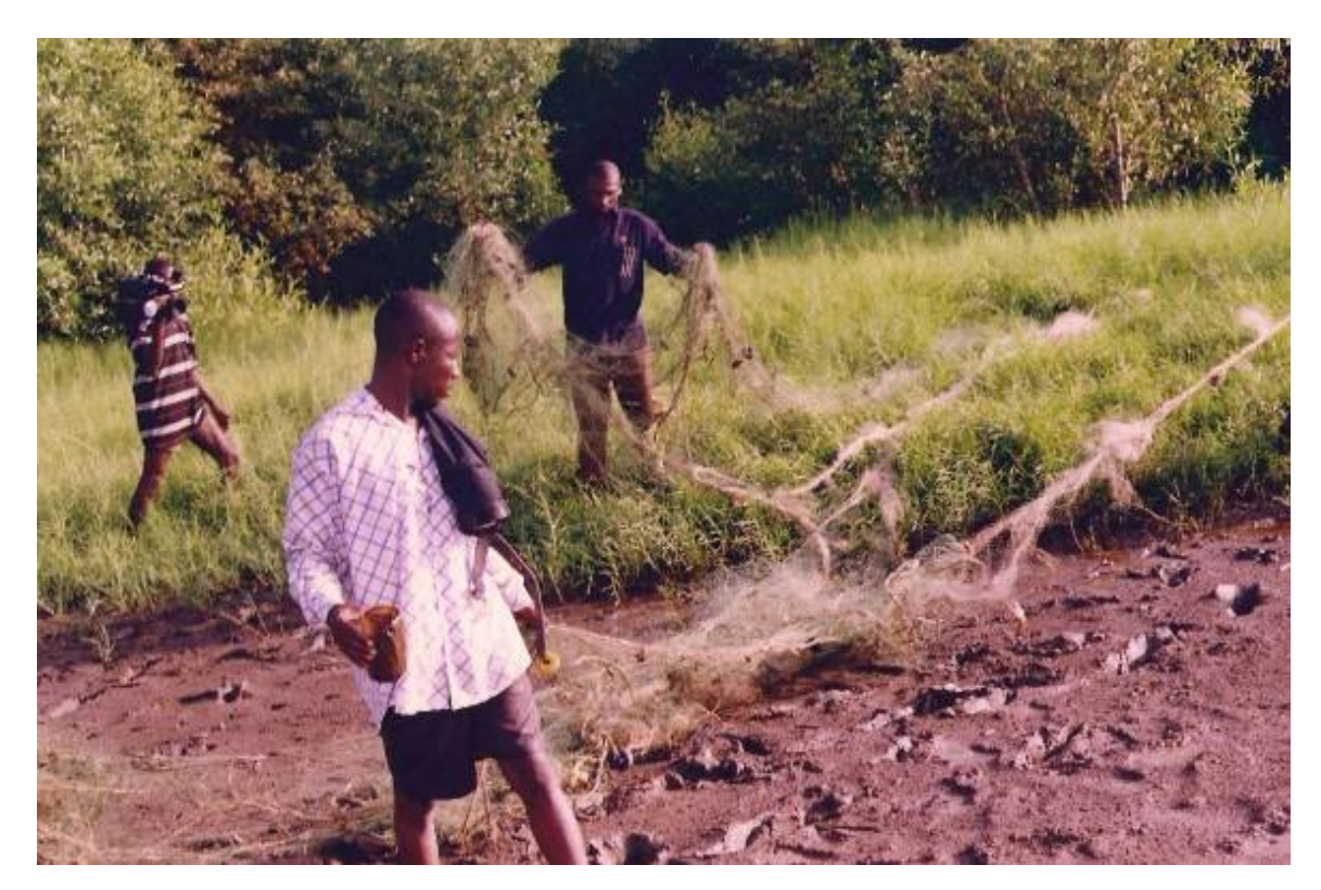
Figure 7. Destruction of the economic base of the people in the region through oil exploitation activity.