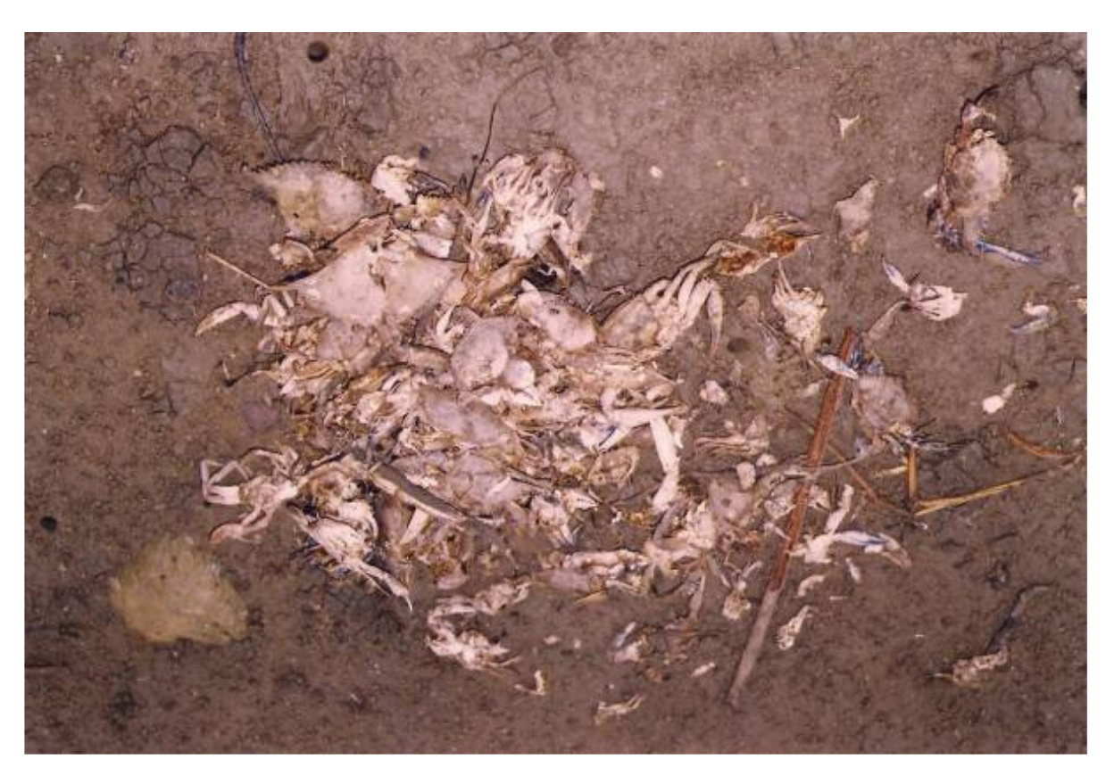
Figure 6. Crabs and other aquatic animals which died from the oil spillage in the region.