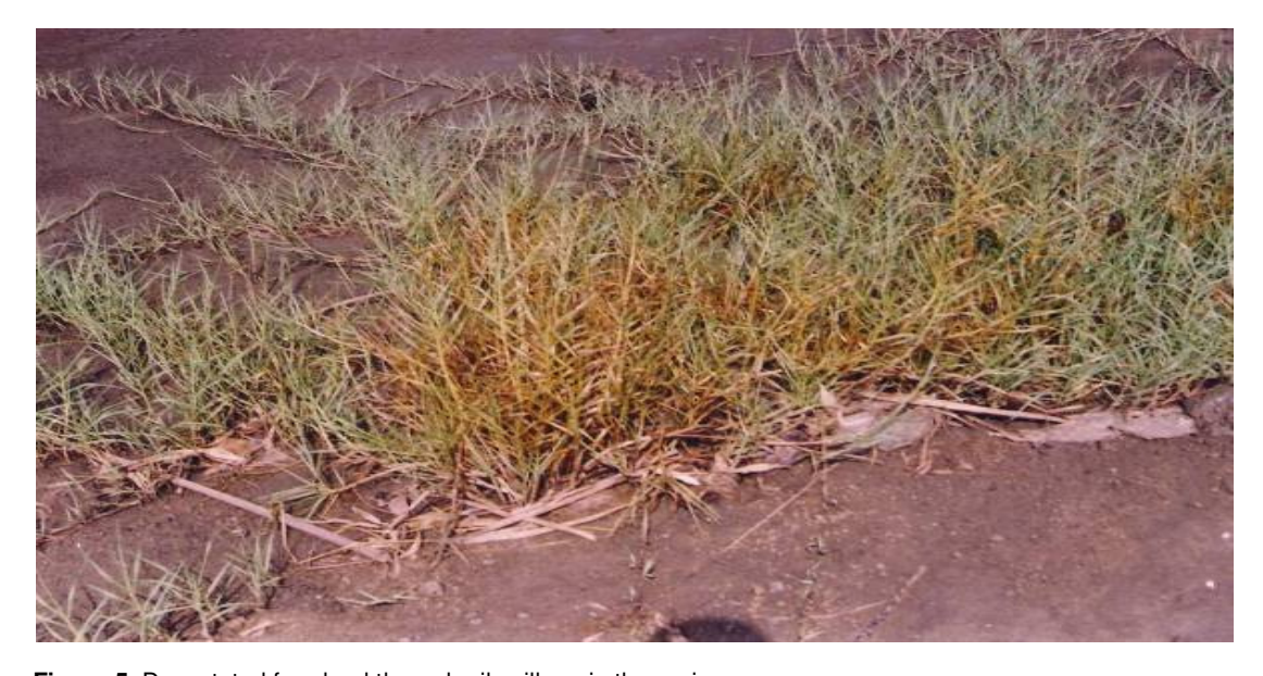
Figure 5. Devastated farmland through oil spillage in the region.