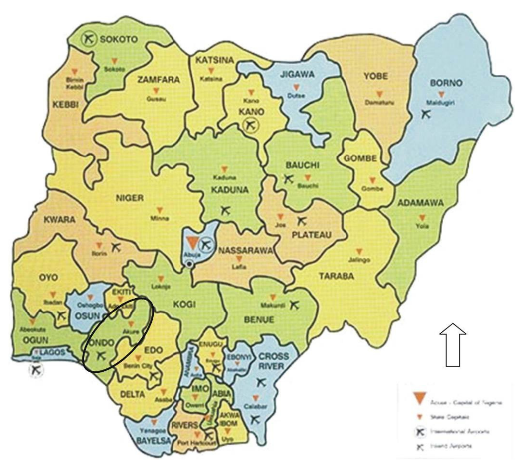
Figure 1. Map of Nigeria showing the location of Ondo State within the country.

Areas. It shares boundaries with Okitipupa Local Government Area in the north; the Atlantic Ocean in the south; Ijebu Waterside Local Government Area (in Ogun State) in the west and Delta state in the east. It consists of over five hundred settlements spreading over 3,000 km². The area boasts of over 180 km long shoreline thereby making it the longest coastline in Nigeria. The study area falls within latitudes 6° and 6° 30' north of the equator and longitudes 4° 45' and 5° 45' east of the Greenwich Meridian. The area is positioned within the equatorial evergreen swamp forest. Figures 1 and 2 shows the location of Ondo state within Nigeria and the location of coastal region of Ondo state (the study area) within Ondo State respectively.