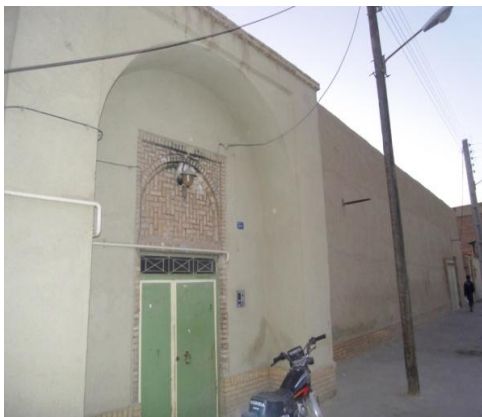
Figure 5. Residential house in the urban-village of Hamidia.

the advertisement of the capitalist world about cities being comfortable to live in, full income employment, world facilities and living facilities); the urban-village residents get familiar with luxury facilities while relating and communicating with the city. This communication would cause changes in the mind and thought of urban-villagers and to use these new facilities to force themselves to adjust to their residential environment with these development. Change in thought, traditions, and culture of urban village areas take up patterns from the urban lifestyle and create changes in space and physical form of urban-village, harmonizing with change in time. The first is the transition stage from a simple rural culture and the second is the tolerance of culture in the urban maze.