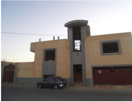
Figure 7. Hamidia urban village.