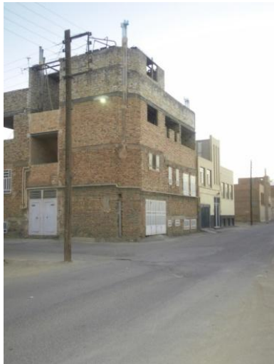
Figure 8. Hamidia urban village.

installments basis loans of 10 million Toman for 12 to 15 years. The most important point in payment of the facilities is how to monitor it. Housing foundation gives loans to those who use approved engineering plans from the organization to build houses. Unfortunately, all the housing offices do not provide anything else except patterns and samples of urban housing. A fixed plan for entire country is executed without considering the climatic condition.