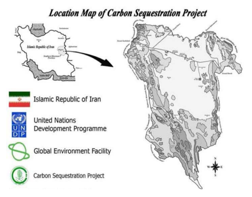
Figure 2. Location map of Carbon Sequestration Project.

interviews and questionnaires. After the collection of data, they were recorded on computer. For efficiency, (SPSS) statistical index software was used for entering the data in the system; the desired frequency tables and other indicators for updating the data were derived. To achieve more comprehensive and accurate information, 25 rural development departments (VDG)<sup>1</sup> in the research area were involved in the study and focus groups help facilitate training and local expensive projects that have been studied; comprehensive information from social institutions (VDG) was obtained.