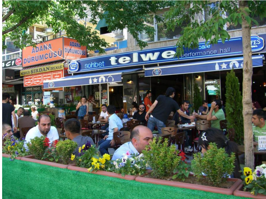
Figure 3. General view of a bar in Sakarya