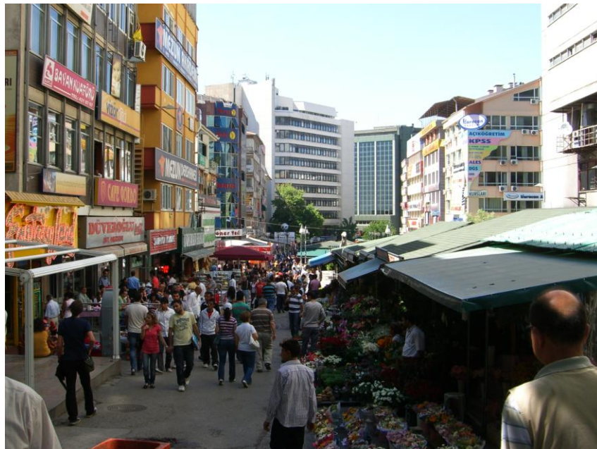
Figure 4. Variety of places and facilities in Sakarya.

experienced incivil behaviors/events and environmental problems that young people mostly encounter in Sakarya. This part included questions on youths' views about Sakarya with respect to 'problems/incivilities' in Sakarya without referring to a specific definition. To deal with the problem of cultural variations in the definition of incivility, without orientating the respondents through direct questions, they were expected to reveal perceived and