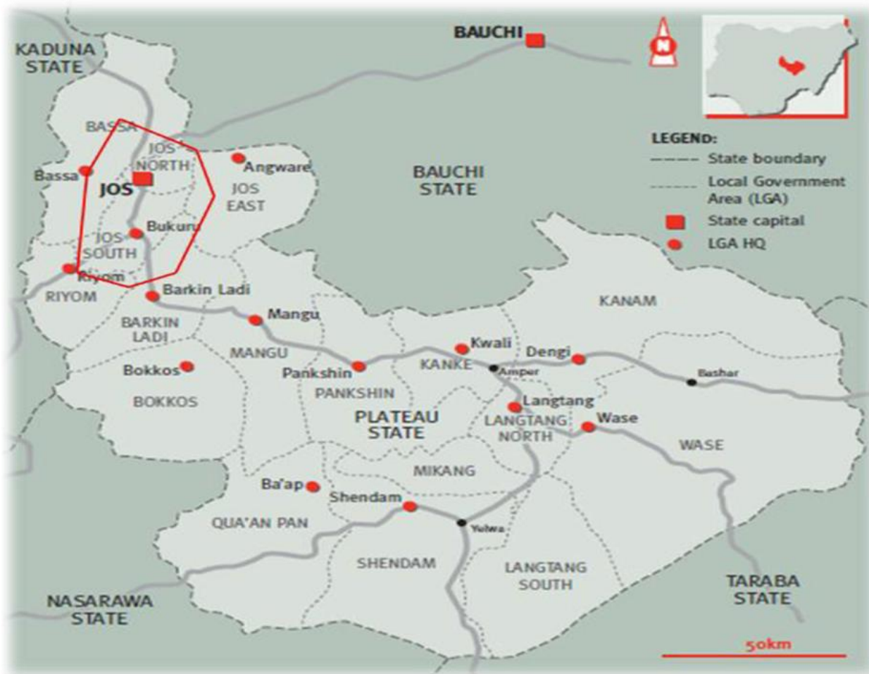
Figure 1. Map of Plateau Showing the study area.

legislation framework (PLs) and administrative framework.