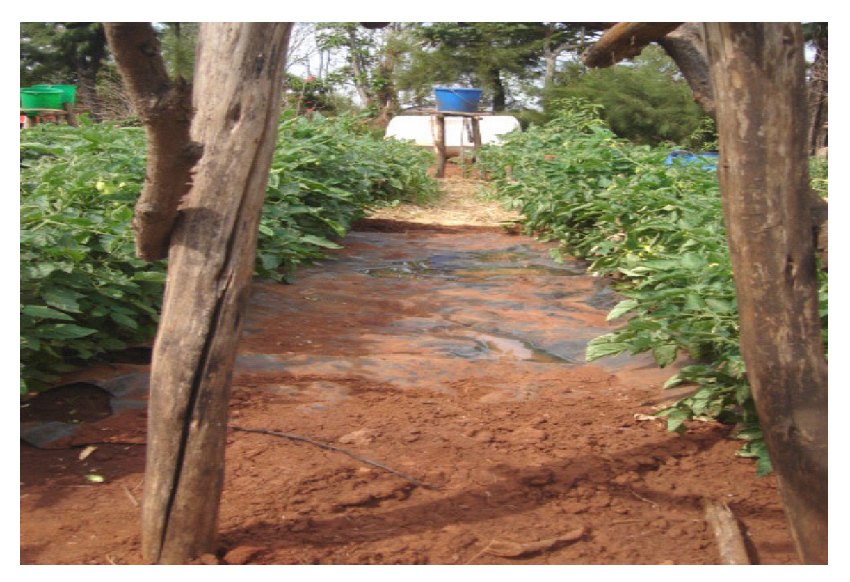
Figure 2. Chapin bucket kits drip irrigation system mounted 1 m above the ground on a stand constructed from wood.

obtained via 565 mm (WL), while the lowest marketable and total fruit yield (39.97 and 46.16 tone/ha) was recorded via 315 mm (WL) (Table 3).