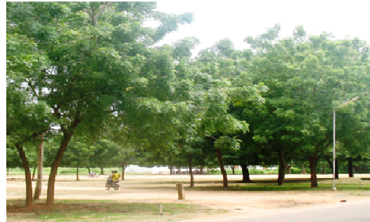
Forest of Azadirachta indica in the courtyard of a public institute