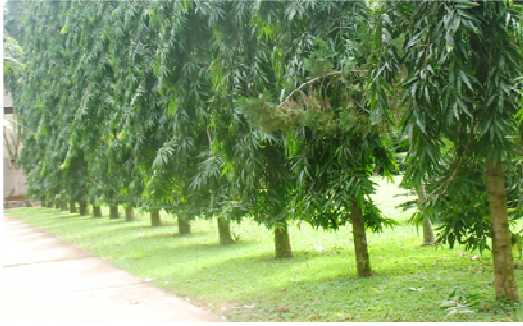
Polyalthia longifolia in alignment in a garden