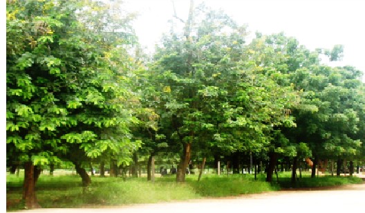
Mixed forest dominated by Senna siamea and Azadirachta indica