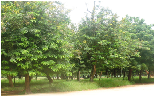
Monospecific forest made of Senna siamea (syn. Cassia siamea )