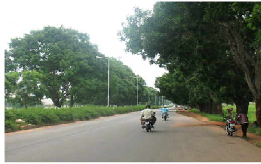
Khaya senegalensis along boulevard