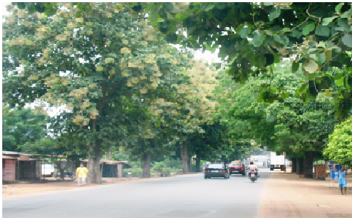
Tectona grandis planted on both sides of an avenue