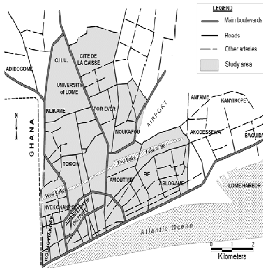
Figure 1. Study area.

capital city of Togo. A specific focus was done on the identification of trees planted in the city and the description of their current management methods. The challenge is that many programs and development projects are underway or planned. This stage of scientific knowledge is urgent to optimize the development plans in urban forestry and to create methods of managing trees and urban green areas. The main target is to promote consideration of diversity and importance of urban trees in an integrated and adapted planning framework. It finally allows emphasizing the importance of the indigenous flora in urban areas, facing the effect of climate change and natural habitat deterioration.