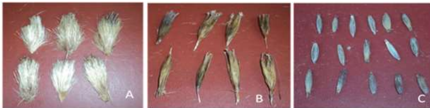
Figure 1. (A) The control B) partial manual removal of pappus and C) total manual removal of pappus of E. giganteus seeds.