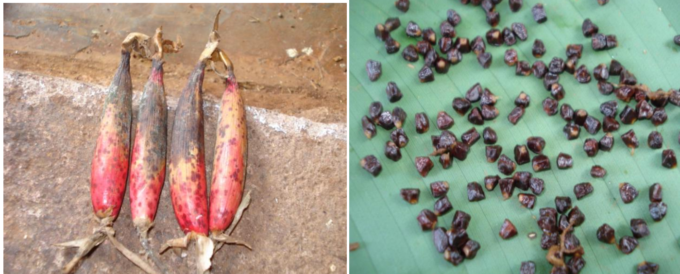
Figure 1. Fresh fruits and seeds of A. melegueta .

performance in the germination of seeds and growth of seedlings of A. melegueta in these soils.