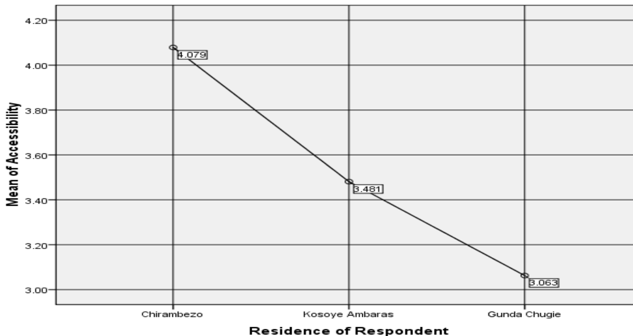
Figure 3. Plotted means of accessibility for each kebele.

A mean average of M=4 agreement is observed for the proximity of the area to other renowned tourist destinations (that is, Simien Mountains National Park and Fasil Castle) that encourage tourists to visit the site (Mehiret et al., 2017).