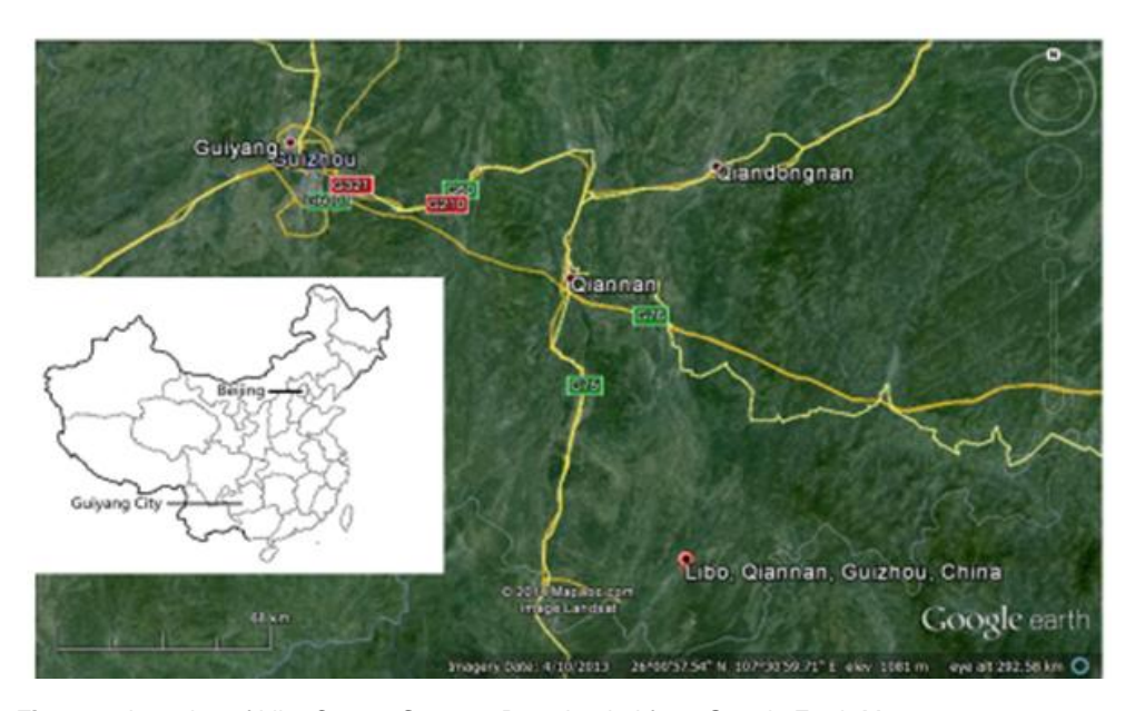
Figure 1. Location of Libo County