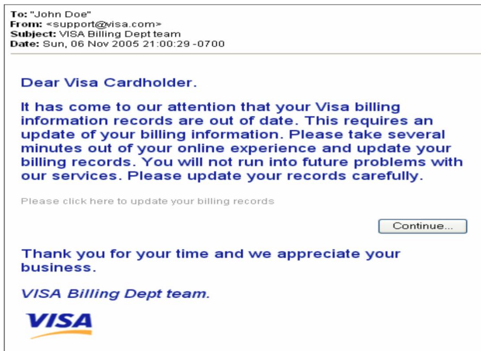
Visa phishing e-mail 127