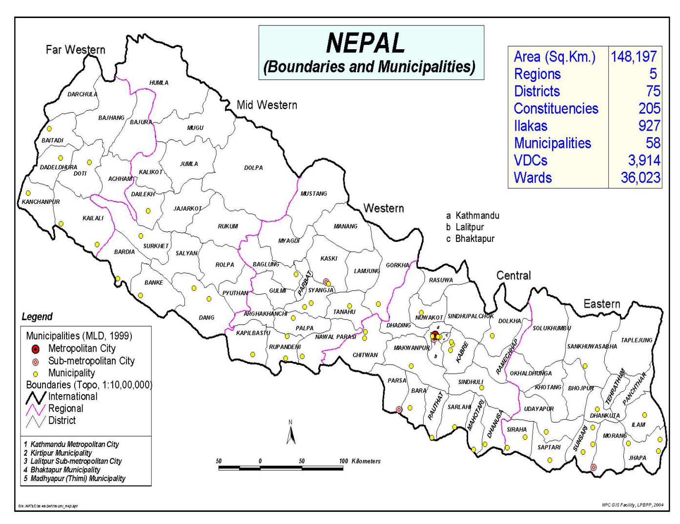
Figure 2. Current Administrative Structure of Nepal. Source: UN Nepal information platform (http://www.un.org.np/maps/maps.php) retrieved on 29 October (http://www.un.org.np/reports/maps/npcgis/NatBio00004.jpg).

have also been analyzed (Cuesta and Murshed, 2008; Jarstad and Nilsson, 2008; Roeder and Rothchild, 2005; Walter, 2002).