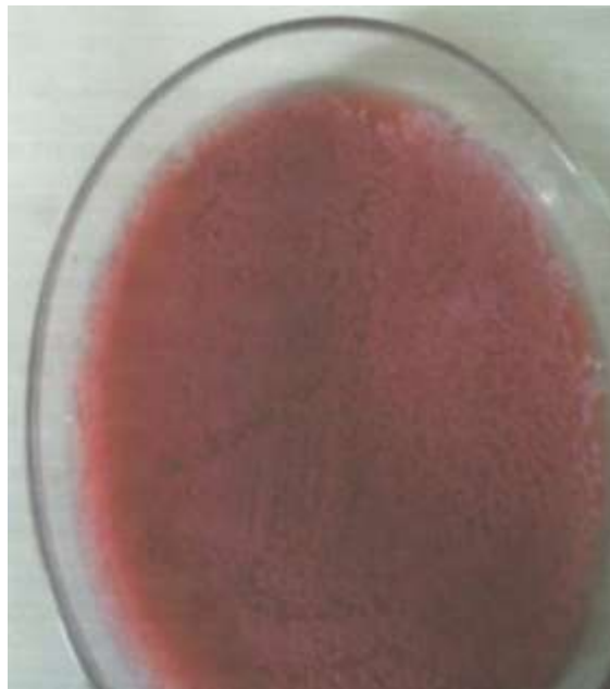
Figure 1. Minimal bactericidal concentration (MBC) test showing microbial growth.