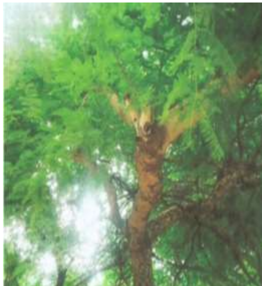
Figure 2. Acacia ataxacantha leaves used for this study.