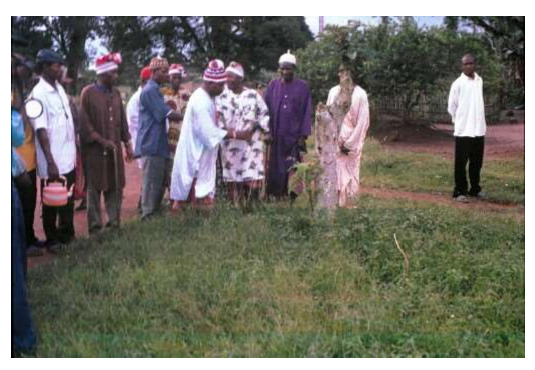
Figure 2. Igbo Religion | Odinani: The Sacred Arts & Sciences of the Igbo people.