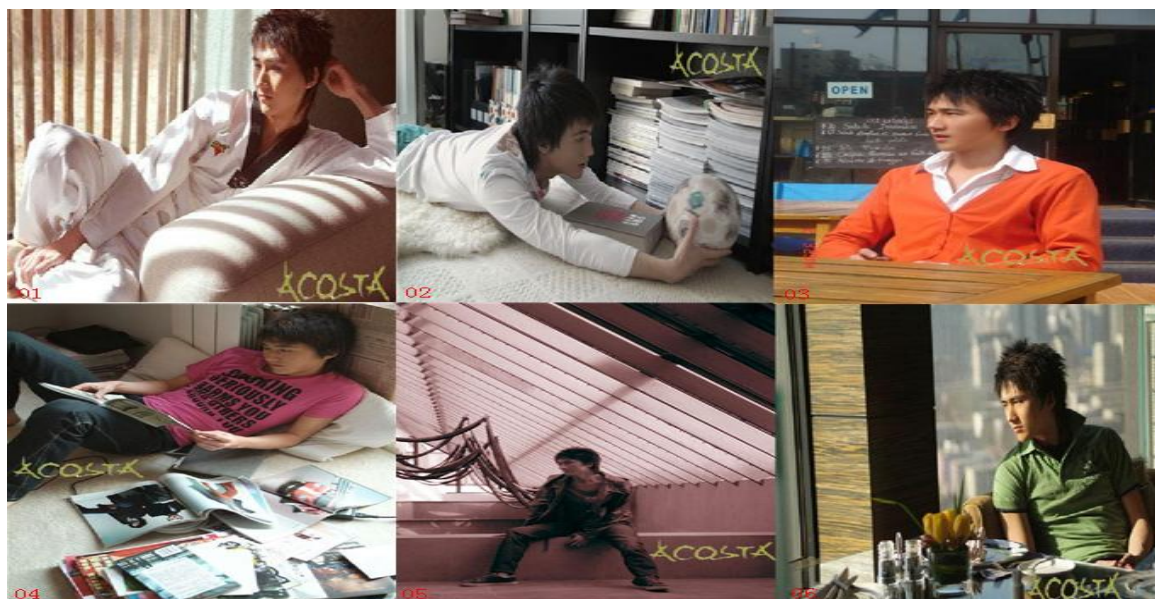
Figure 2. Acosta's photo collage.

not attainable. The venues for three of the photos (01, 02, and 04) are indoors and the other three are outdoors. It is not, however, possible to figure out the exact location where they were taken. It may be inferred that two of the outdoor photos (03, and 05) were taken in some other countries because of the background behind the blogger.