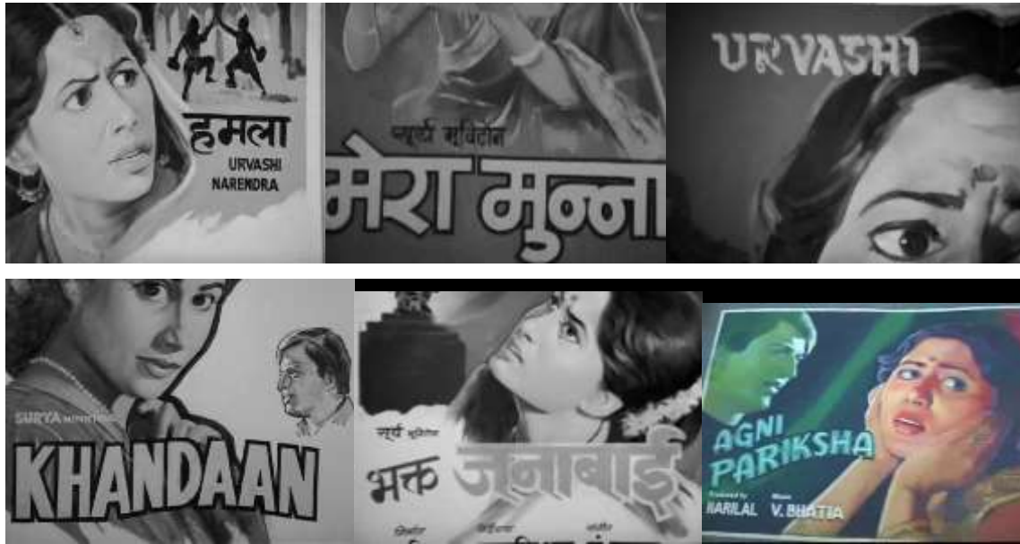
Figure 1. Posters of Usha's films.