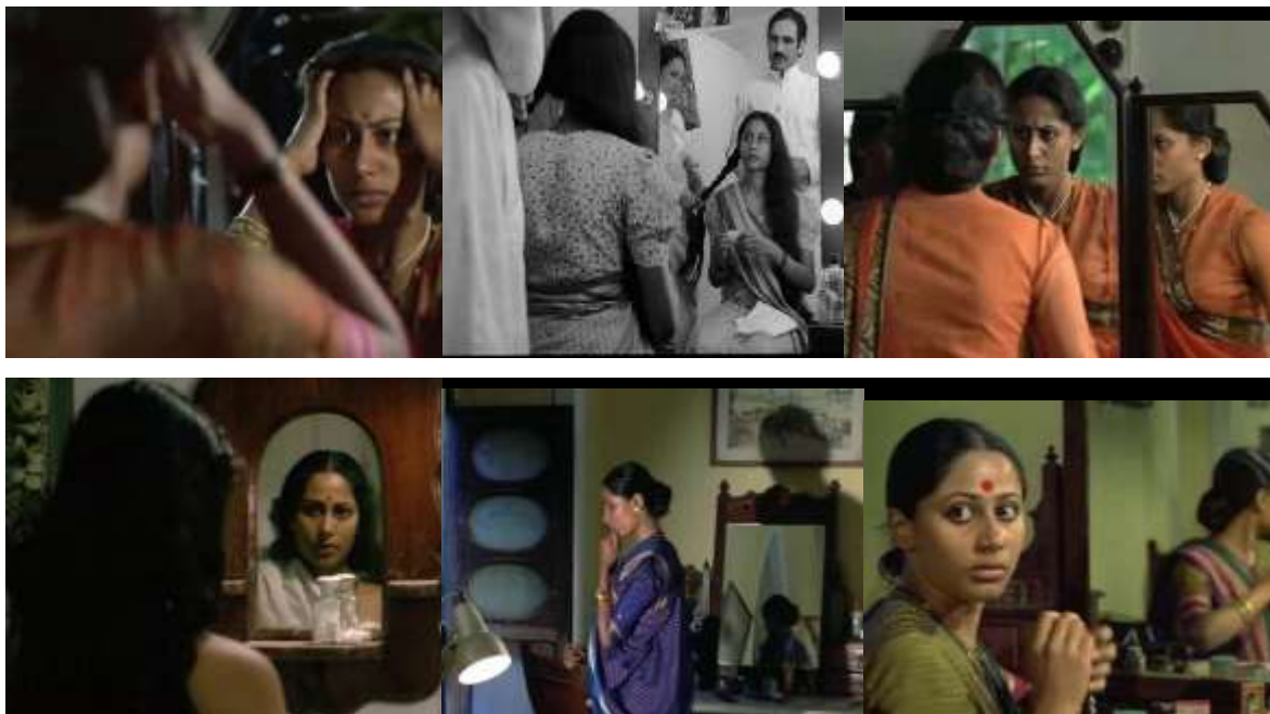
Figure 2. Facing mirror: Facing reality of life.

from all the roles in life. Everytime she seems looking at her another face in mirror, the face of a completely independent woman and remains unsatisfied by not finding it (Figure 2).